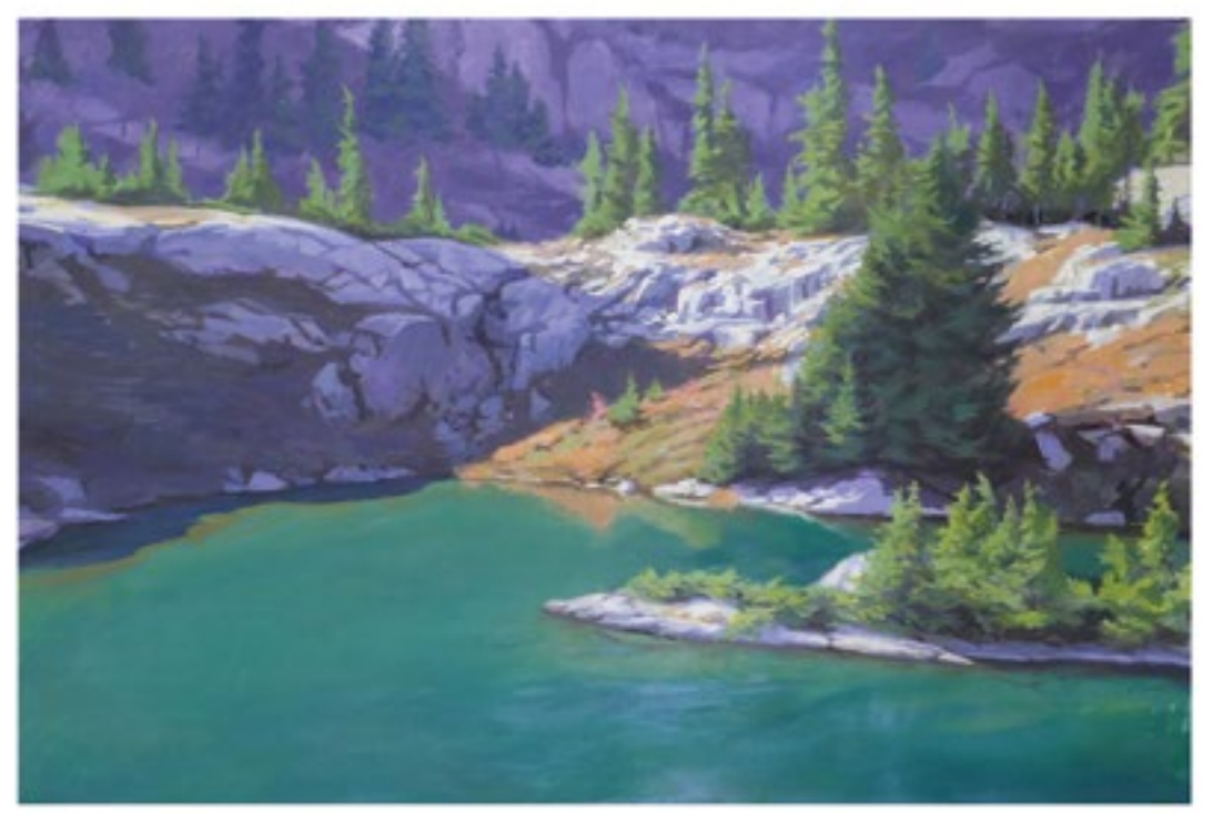
Lila Lake oil 30 x 40

Under the West Seattle Bridge oil 30 x 40