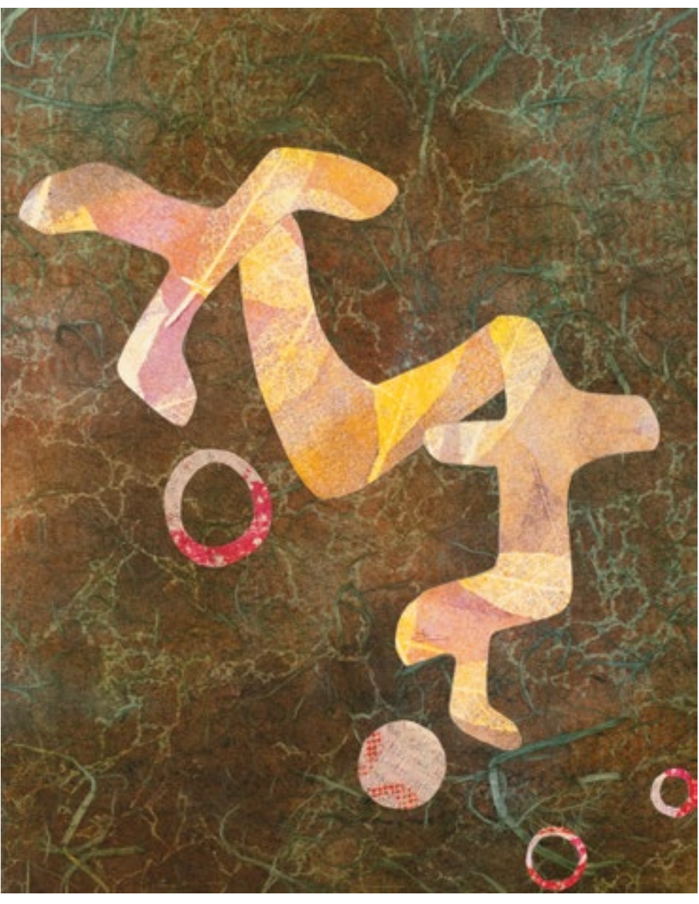
Joan Wortis, Gallivanting, 2023, collage with handmade Japanese paper on panel, 14 x 11 inches