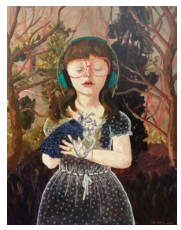
"Heart Kissing," acrylic on panel, 30 x 24 in.

"Wild Child" connects me back to a series of paintings that I created mostly from 2007 to 2016 in which children are the main characters. For this exhibition, I have absorbed myself with the inner child first and foremost. One of the members of my inner family. What are they telling me? What are they sensing? What wisdom do they possess? How can I care for and nurture them? Their favorite environment is nature- the all-healing place; the inner sacred garden; a place in which, as an adult, I find deep healing and comfort in my daily life and is in such close reach to my home in Seattle. Elements of dreams, fairy tales, and my own childhood also play a significant role." - Anne Siems