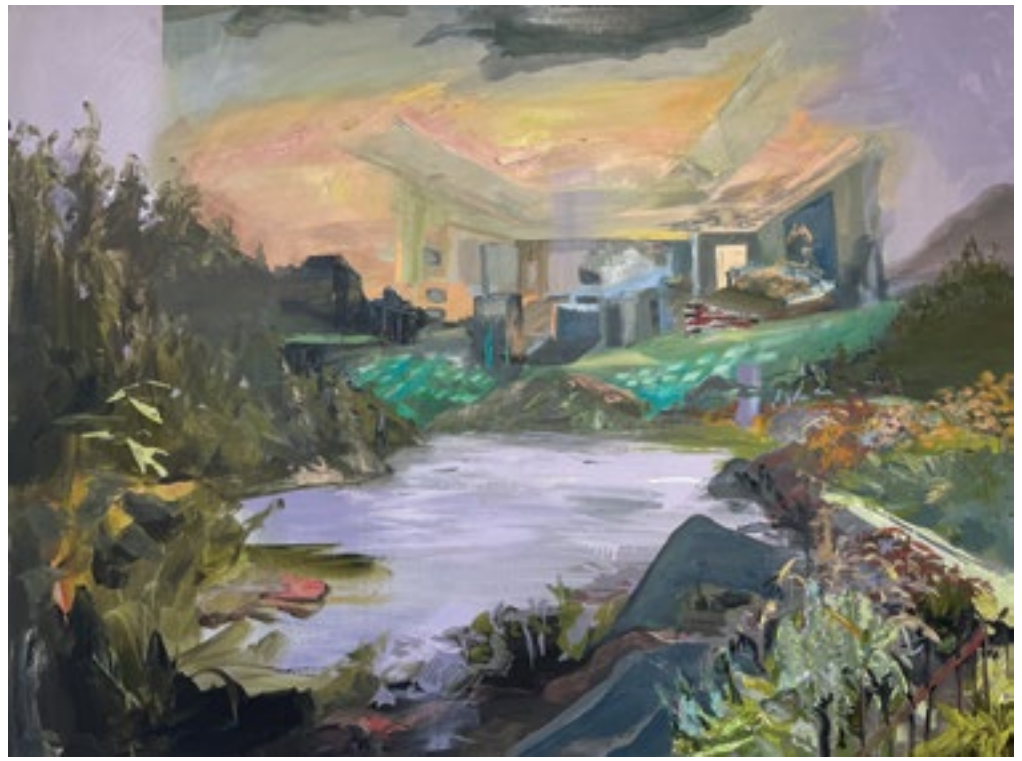
MIDNIGHT BLISS, 2023, acrylic and oil on canvas, 36 x 48 inches