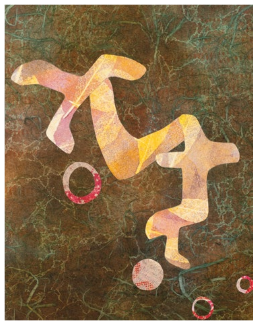
Joan Wortis, Gallivanting, 2023, collage with handmade Japanese paper on panel, 14 x 11 inches