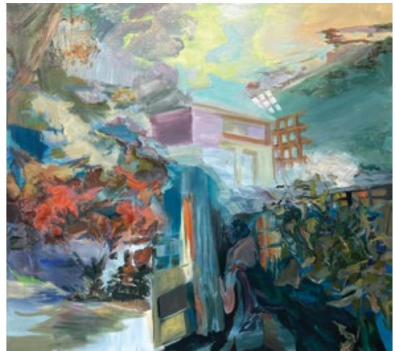
SUNBREAK SHIFTING, 2024, acrylic and oil on canvas, 60 x 64 inches

"First Thursday" art walk: March 7, 6–8pm "Saturday After" artist talk: March 9 at noon