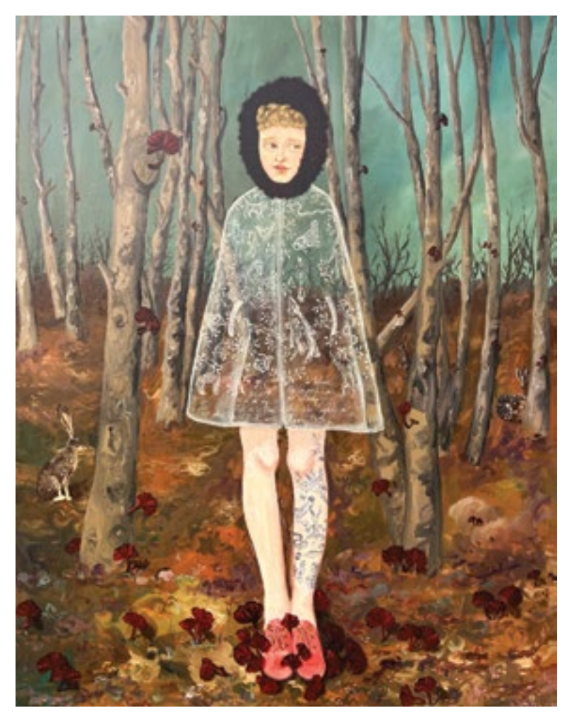
"Red Mushrooms," acrylic on panel, 60 x 48 in.

MARCH 1 - 30, 2024 Champagne Reception: Saturday, March 2, 3-5pm ARTIST TALK 4PM