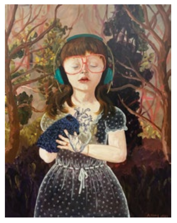
"Heart Kissing," acrylic on panel, 30 x 24 in.