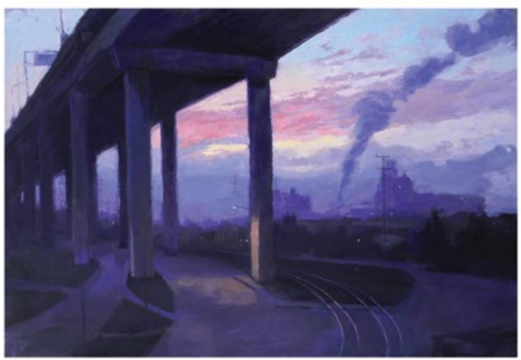
Under the West Seattle Bridge oil 30 \times 40

March 7 - 31 Artist Reception- Sat March 9th, 5-7pm