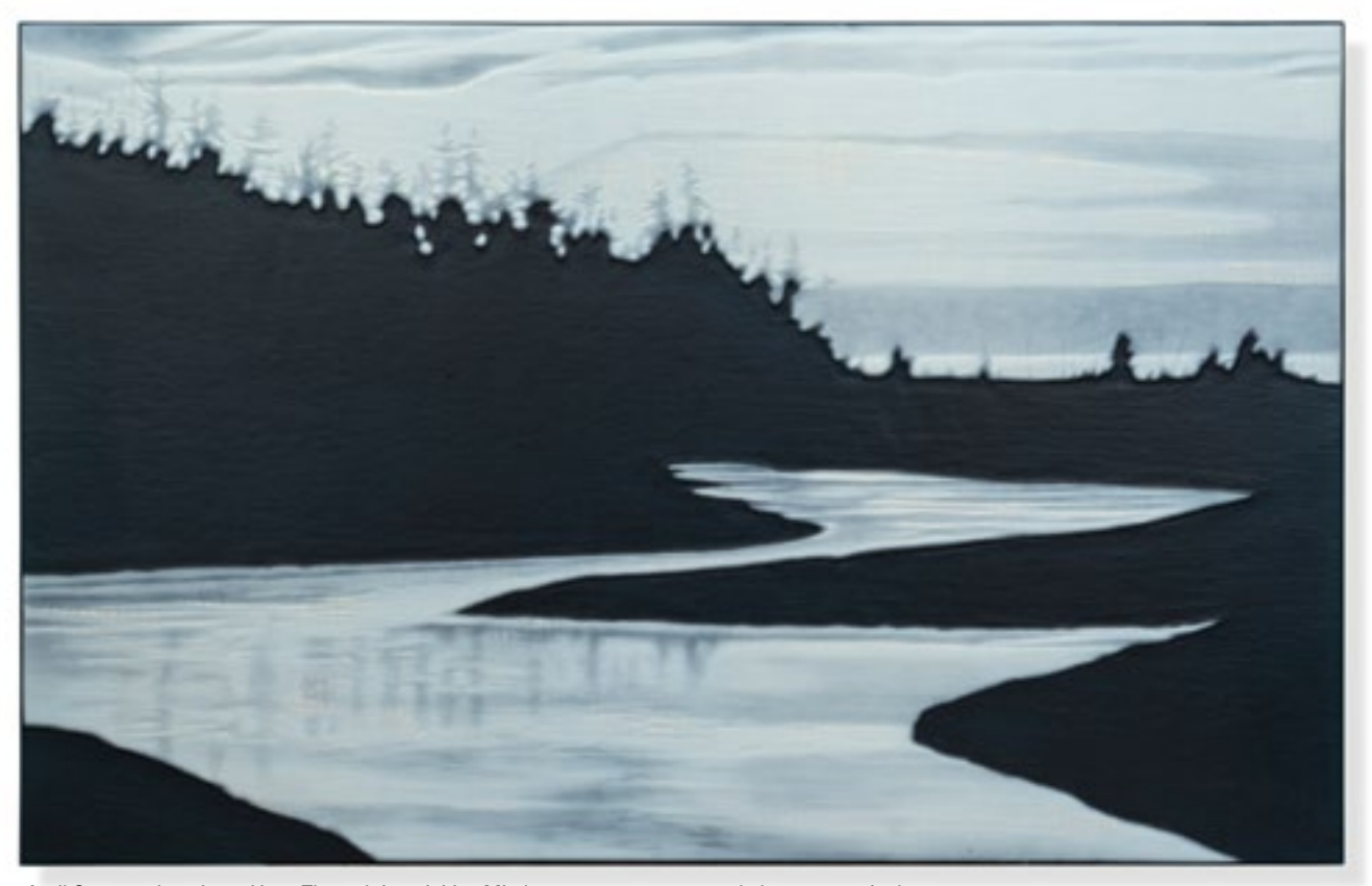
April \ Surgent, \ \textit{Imaginary Lines Through Imaginitive Minds}, 2024, cameo \ engraved \ glass, 19 \ x \ 30 \ inches cover: The World is Changing Quickly Now/And I am Changing Too, 2023, cameo engraved glass, oil pastel, watercolor, 34 x 18.5 inches