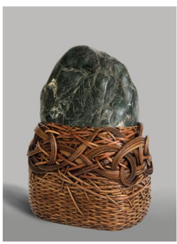
"Coastal Erratics," stone, bamboo, & rattan, 18 x 14 x 10 in.

Champagne Reception: Saturday, April 6, 3-5pm ARTIST TALK 4PM