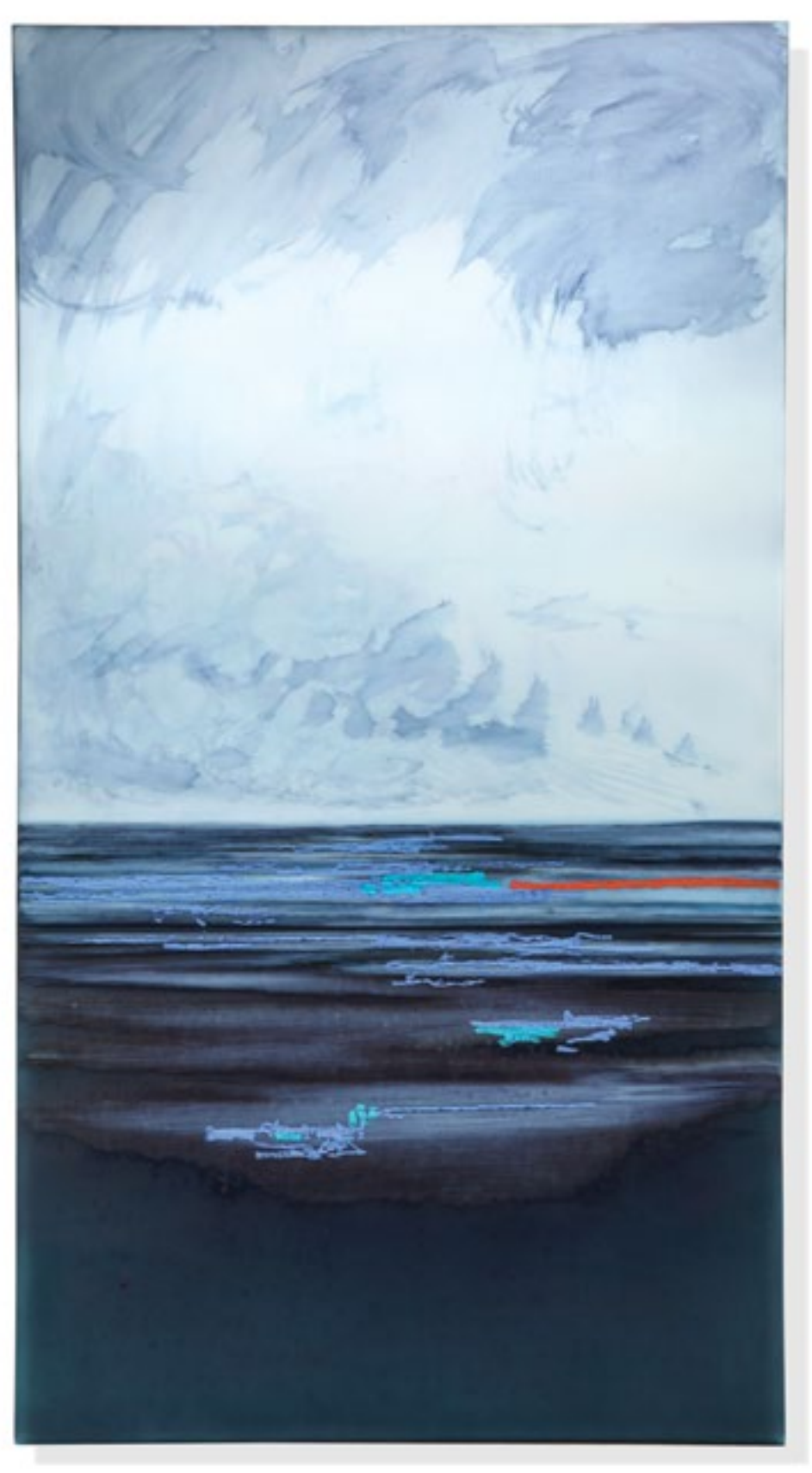
APRIL SURGENT FUTURE UNFOLDING APRIL 4–27, 2024 TRAVER GALLERY