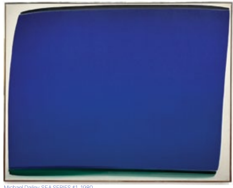
Michael Dailey, SEA SERIES #1, 1980 Acrylic on canvas, 65.5 x 84.25 inches