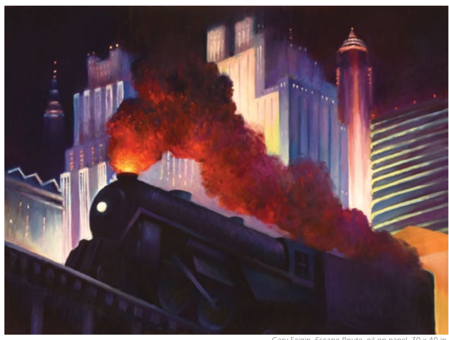
Gary Faigin, Escape Route, oil on panel, 30 x 40 in.

April 4 - 28 Artist Reception- Sat April 6th 4 - 6pm