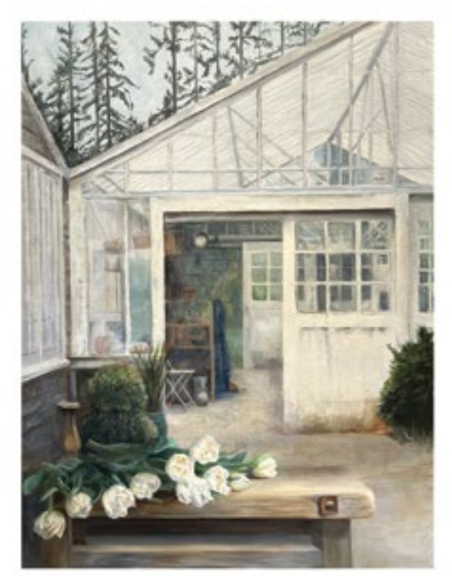
First Blooms Awaken oil 40 x 30