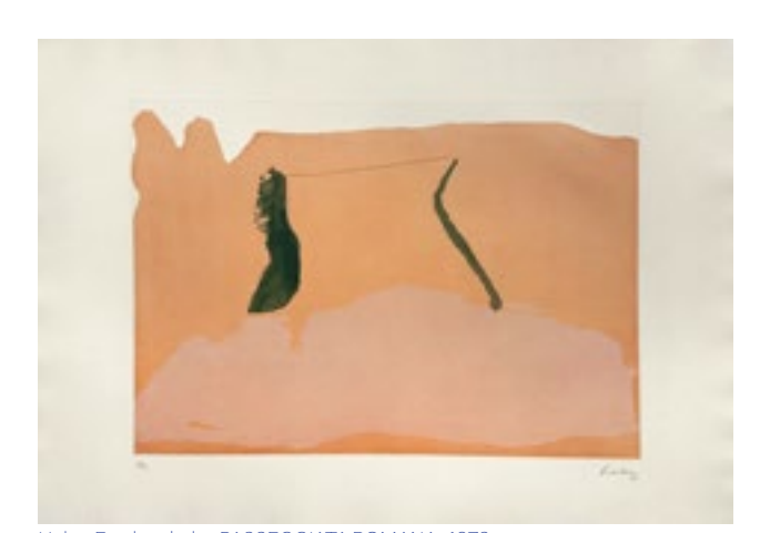
Helen Frankenthaler, PASSEGGIATA ROMANA, 1973 Sugarlift etching and aquatint on paper, 27.5 x 39.5 inches, edition of 32