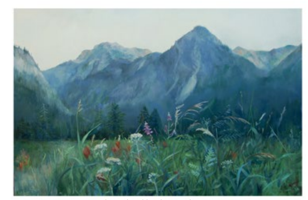
Alongside Wild and Fierce oil 24 x 36