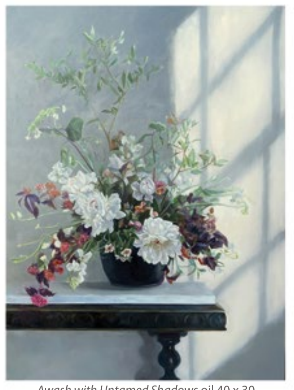
Awash with Untamed Shadows oil 40 x 30