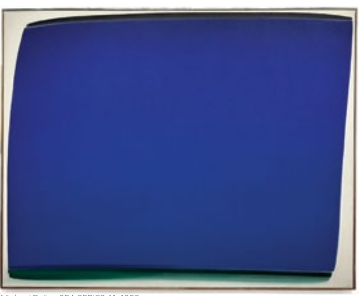
Michael Dailey, SEA SERIES #1, 1980 Acrylic on canvas, 65.5 x 84.25 inches