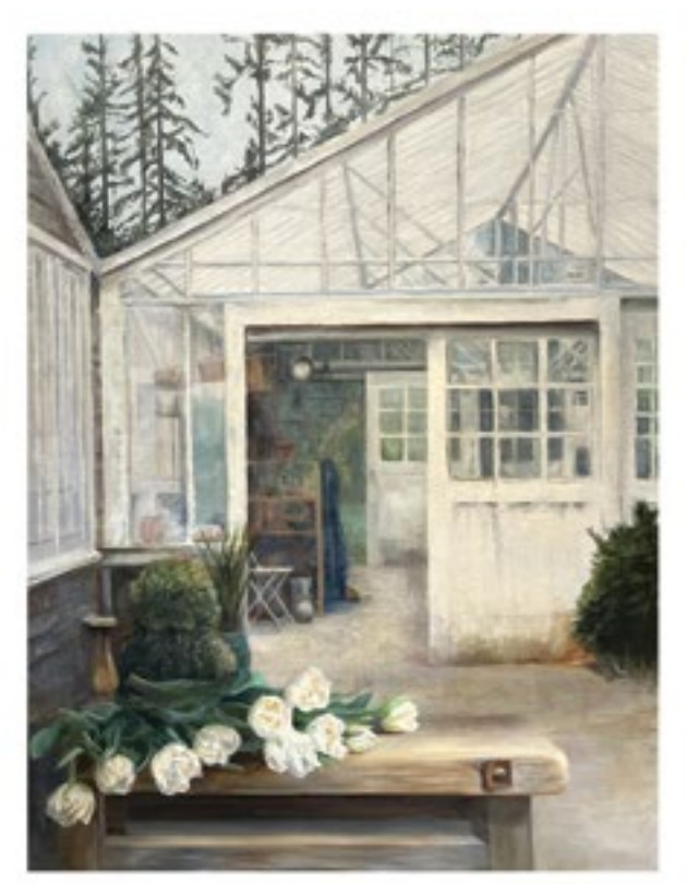
First Blooms Awaken oil 40 x 30