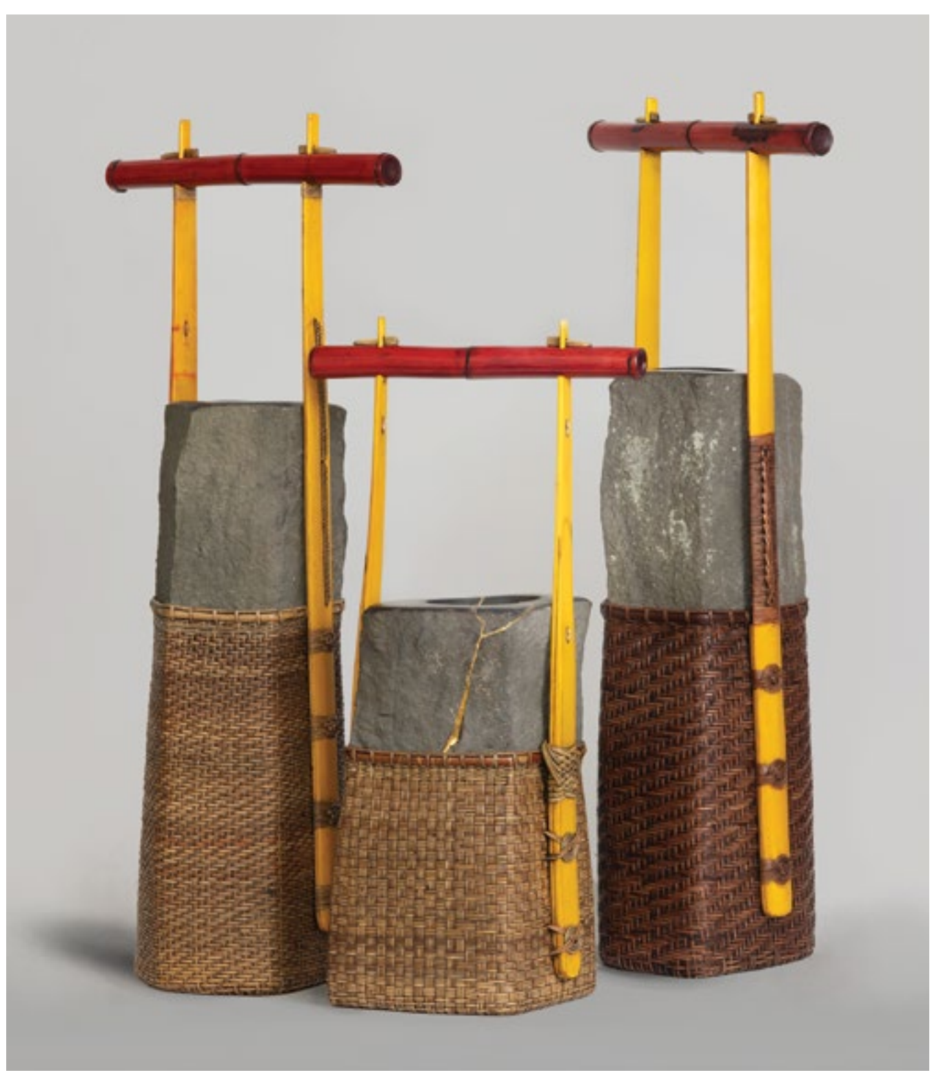
"Carrying Water I, II, III," basalt, yellow cedar, bamboo, rattan & kintsugi, Right to Left: 35 \times 15 \times 10 in. | 26 \times 14 \times 10 in. | 35 \times 15 \times 10 in.