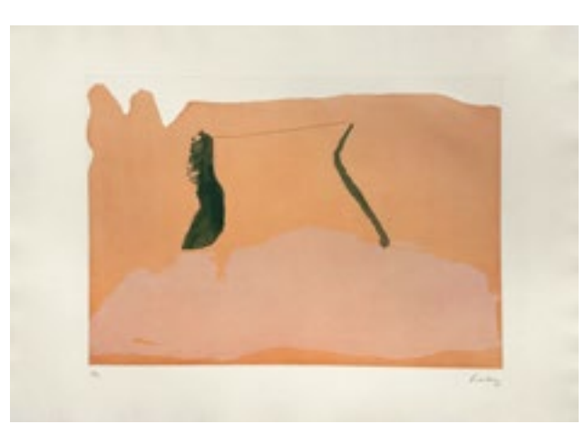
Helen Frankenthaler, PASSEGGIATA ROMANA, 1973 Sugarlift etching and aquatint on paper, 27.5 x 39.5 inches, edition of 32