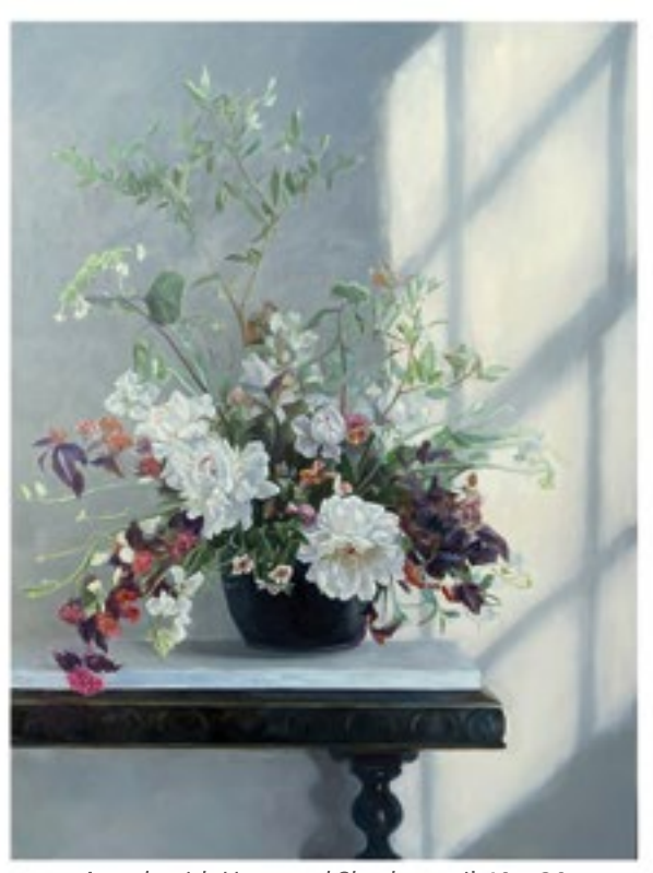
Awash with Untamed Shadows oil 40 x 30