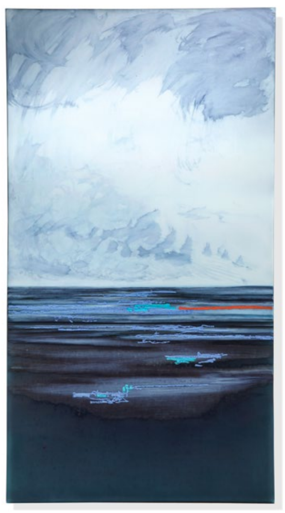
APRIL SURGENT FUTURE UNFOLDING APRIL 4–27, 2024 TRAVER GALLERY