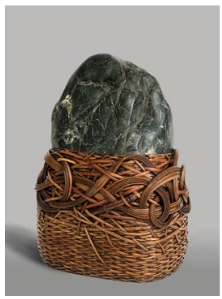
"Coastal Erratics," stone, bamboo, & rattan, 18 x 14 x 10 in.

Champagne Reception: Saturday, April 6, 3-5pm ARTIST TALK 4PM