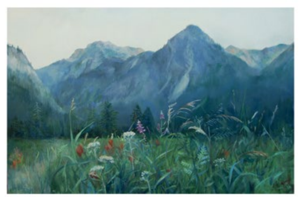
Alongside Wild and Fierce oil 24 x 36

April 4 - 28 Artist Reception- Sat April 6th 4 - 6pm