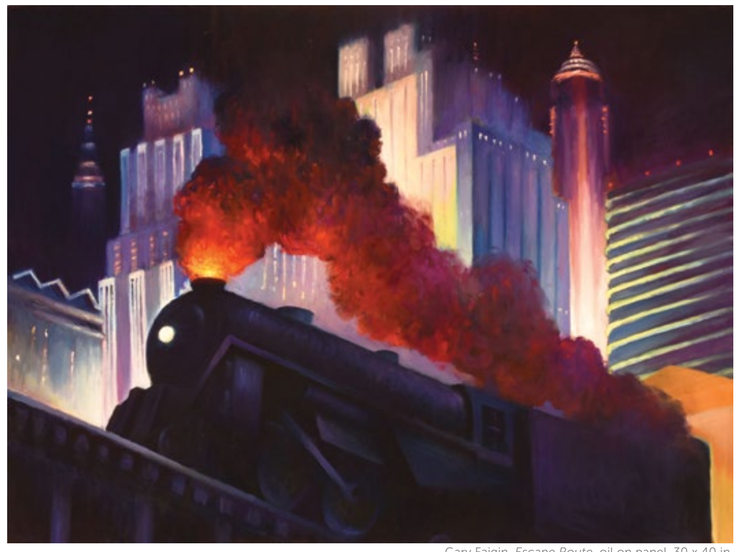
Gary Faigin, Escape Route, oil on panel, 30 x 40 in.