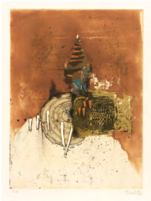
Johnny Friedlaender, Der Triumphwagen des Antimons . Color etching and aquatint. 15 x 11 1 / 4 inches.