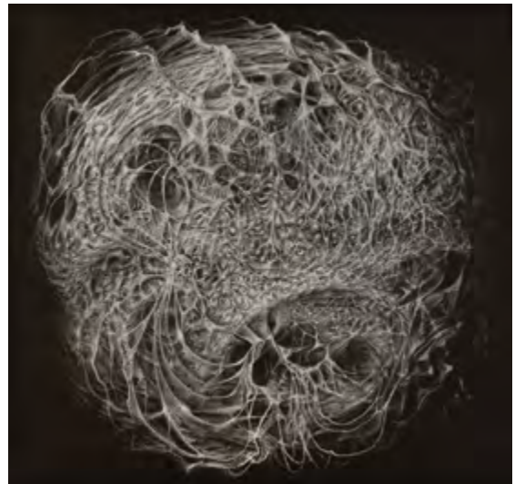
Bette Burgoyne, Persona . White pencil on black paper. 11 1/2 x 12 inches.