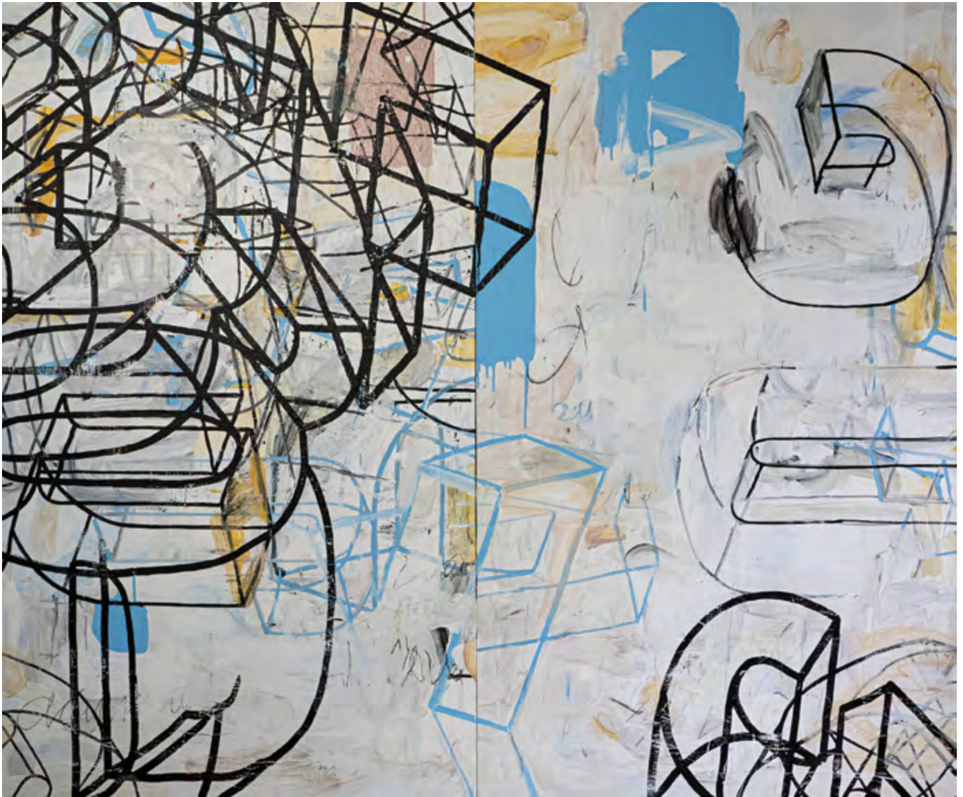
Harold Hollingsworth, Canyon Echo , 2022, acrylic and collage on birch, 60 x 73 x 3 inches