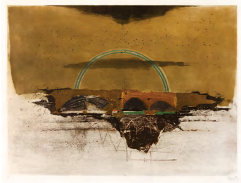
Johnny Friedlaender, Noon . Color woodcut. 23 x 30 1 / 8 inches.