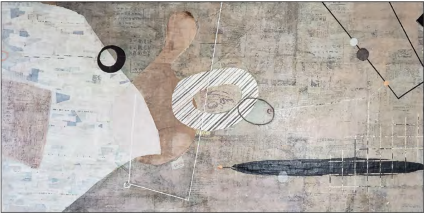
Sherry Ying Ruden , Cherishing the Moment II , Chinese rice paper, cold wax, mixed media on panel, 24 x 48, 2022