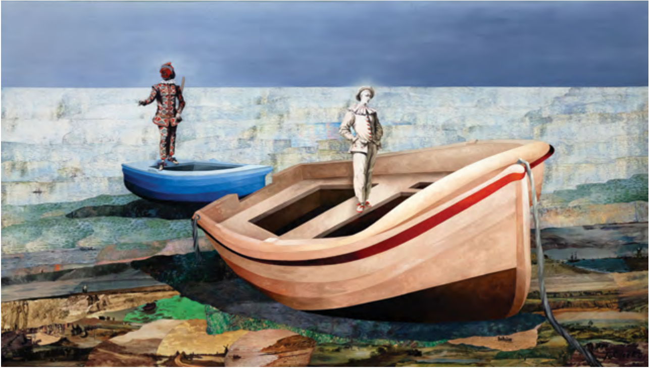
"Arlecchino & Pedrolino," oil & collage on canvas, 34 x 60 in.

ARTISTS MEET & GREET: SATURDAY, JANUARY 7, 3-5PM