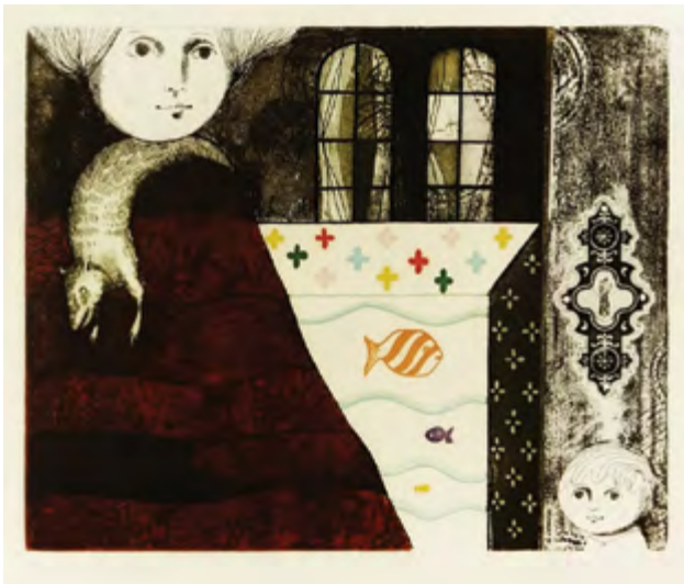
Leticia Terrago, Espejo De Agua . Color etching. 7 7/8 x 9 1/2 inches.