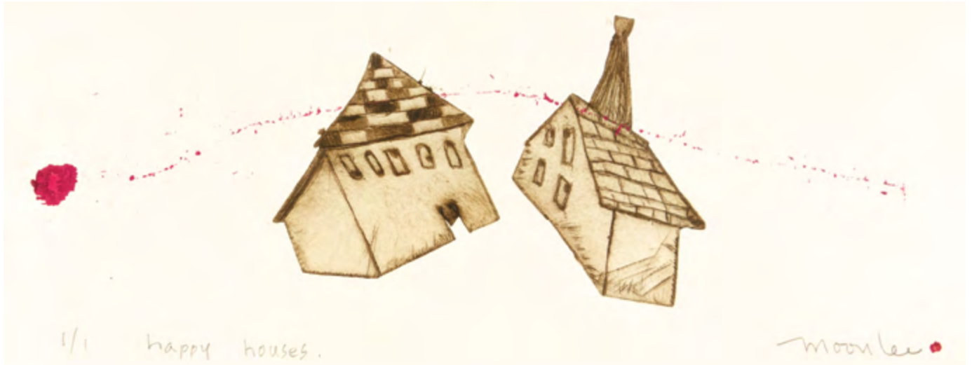
Moon Lee, Happy Houses . Etching and monoprint. 4 ¼ x 11 ¼ inches.

Finding Home: A Selection of My Observations and Experiences