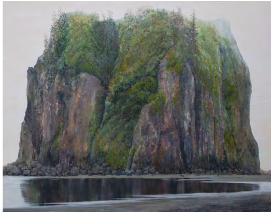
BOTTOM: Sea Stack , 2022, oil on panel, 20" x 24"