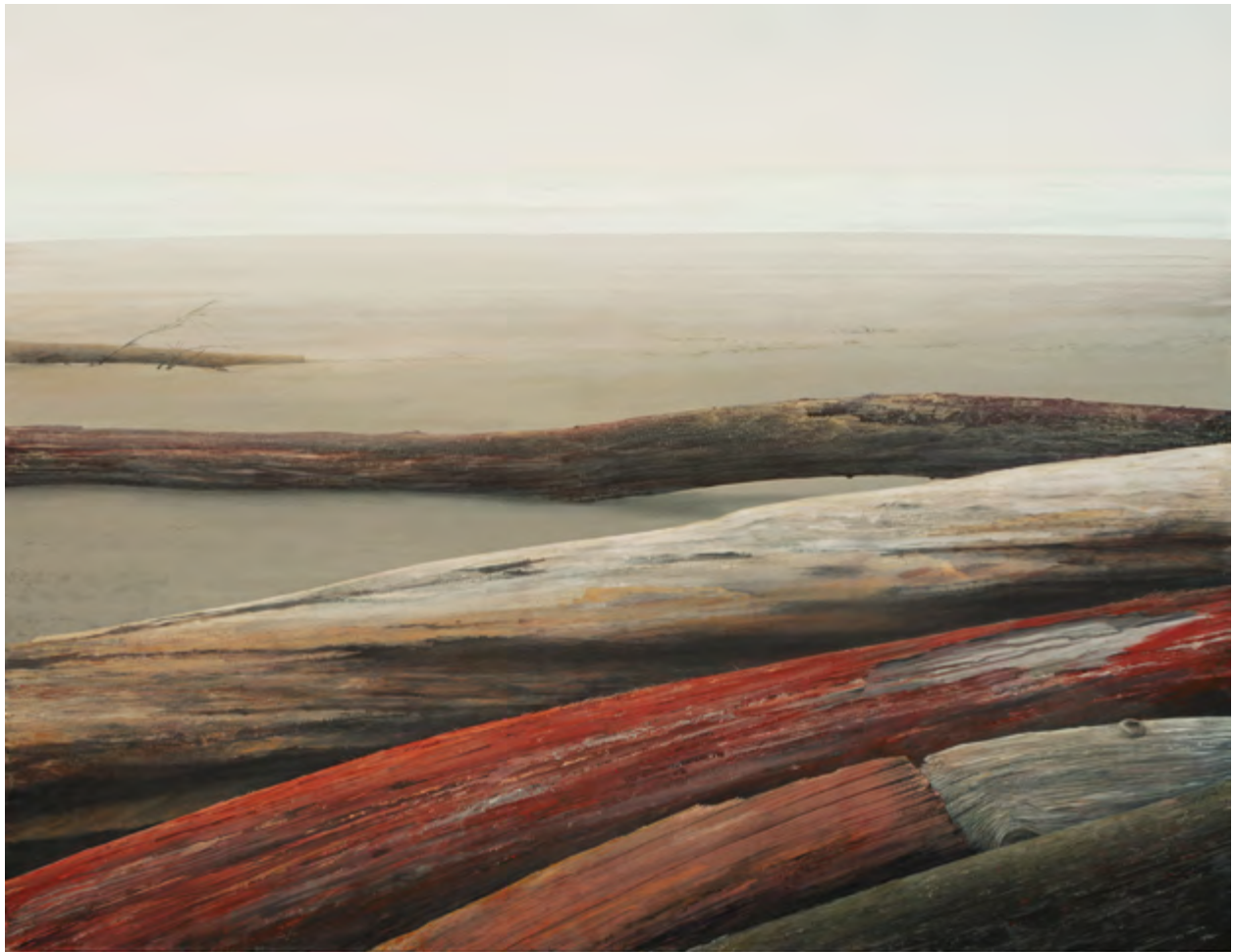
Log Pile, 2022, oil on canvas, 56" x 72"