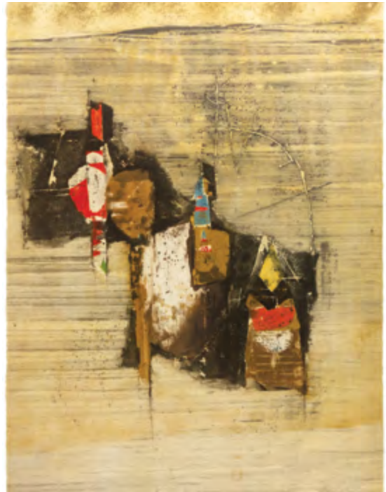
Johnny Friedlaender, Rouge Dominant . Ten color etching. 30 x 22 inches.