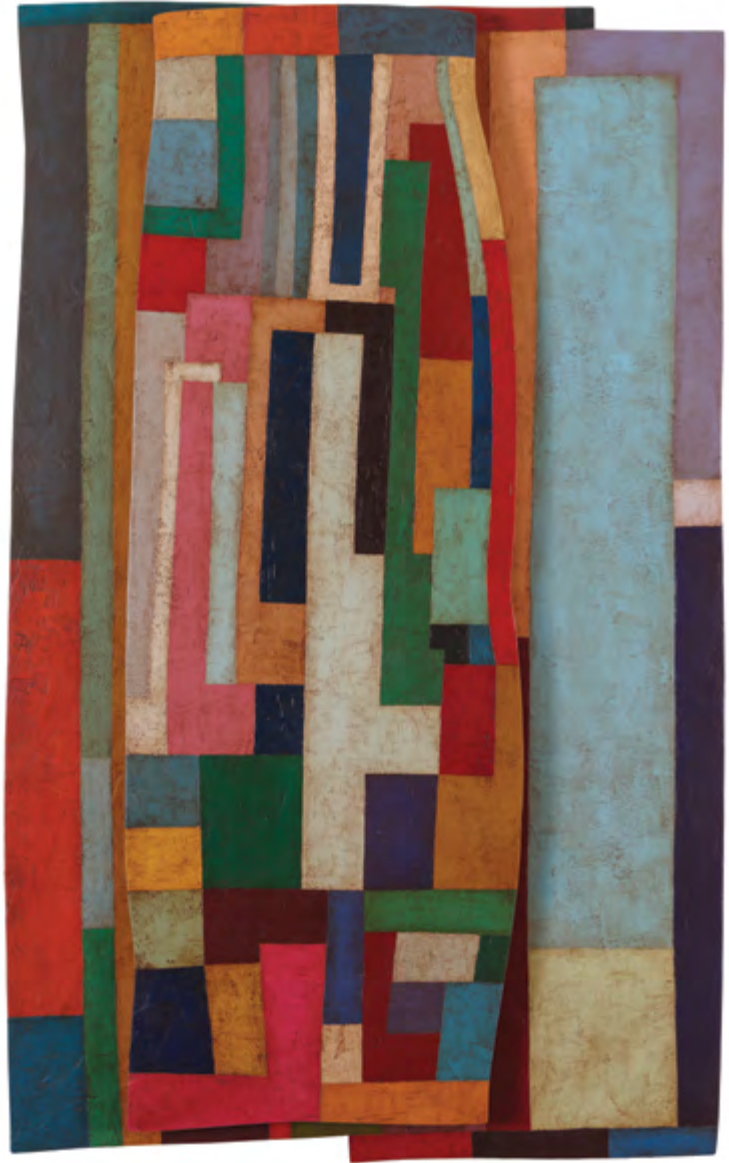
"Inland," mixed media on shaped panel, 38 x 24 x 2.5 in.

This body of work is a continuation of French's exploration into painting & his interest in bringing painting into sculptural forms. There is a quiet conversation that the artist engages with, a dance of spontaneity, intuition & preparation, in large part informed by his many years of painting carved-wood sculpture. This series of abstract works balances geometric rhythm with organic movement & texture, creating an evocative play between shape & color.