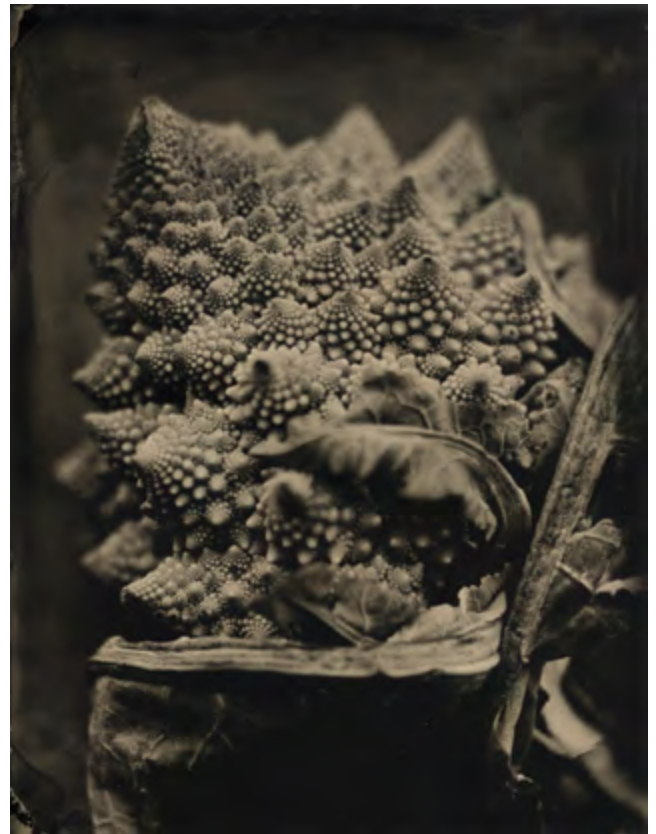
Jenny Sampson, Romanesco , wet plate collodion tintype, 4.5 x 3.5 in.