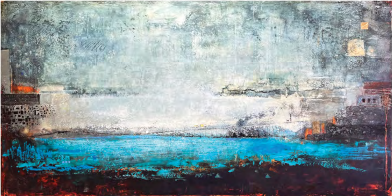
Bergen Rose , Just Passing Through , oil & cold wax mixed media on panel, 30 x 60, 2022