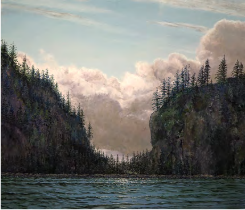
LEFT: Gap , 2022, oil on panel, 20" x 24"