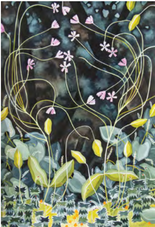
Erin Kendig, Candy Flower 1 , watercolor and gouache on paper, 18 x 12 in.