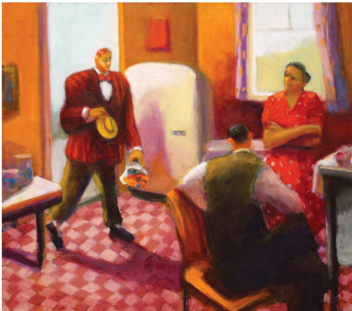
Lois Silver, The Suitor , oil on board, 16 x 18 in.