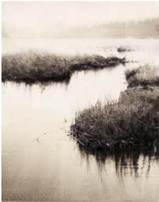
Wendy Orville, Nisqually Mist . Monotype. 14½ x 11½ inches.