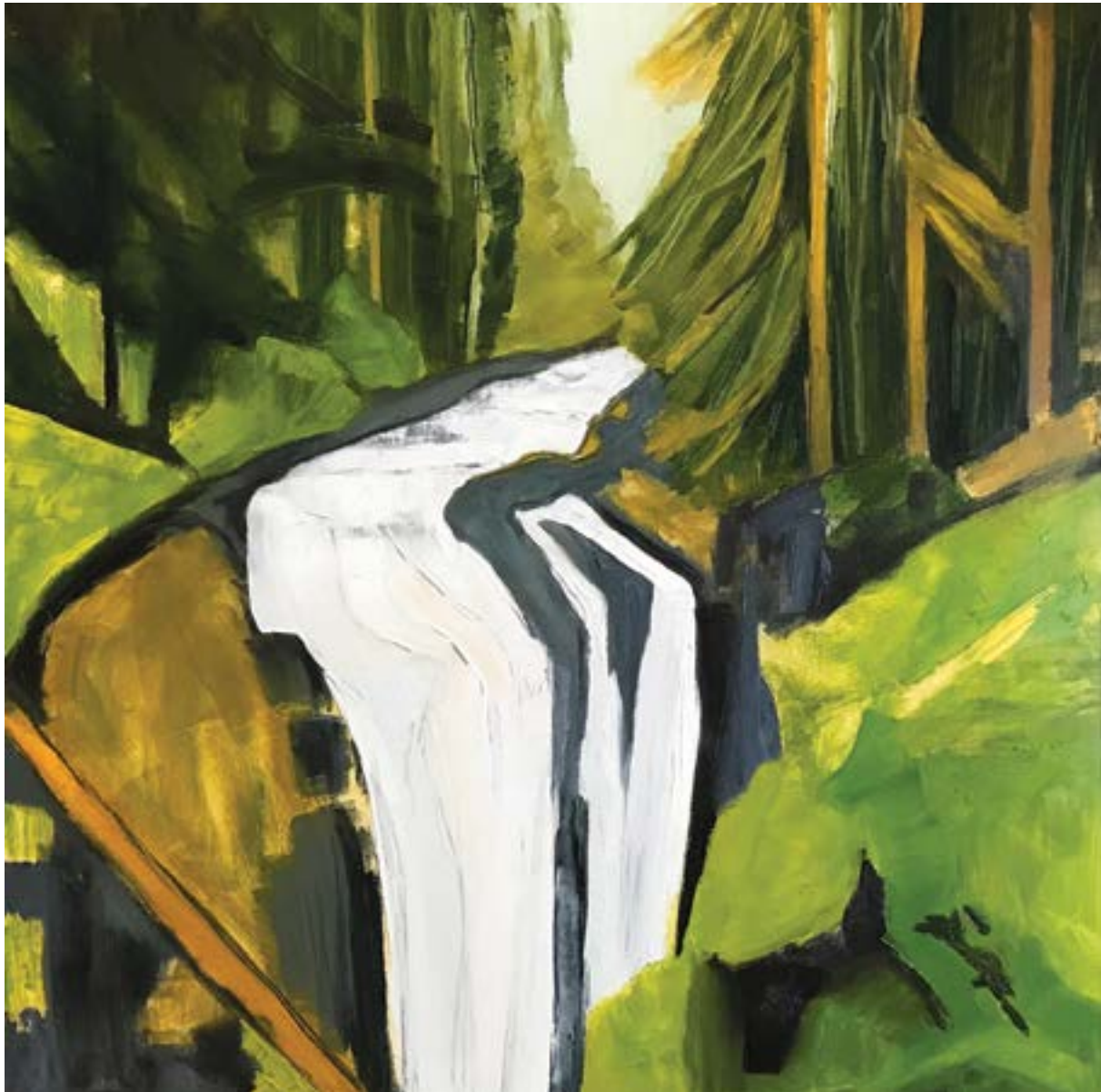
Hart James, Sol Duc , oil and charcoal on canvas, 36 x 36 in.