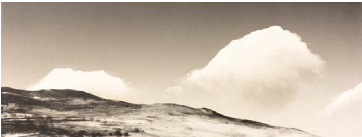
Wendy Orville, Pilar Ridge . Monotype. 7 x 17⅞ inches.