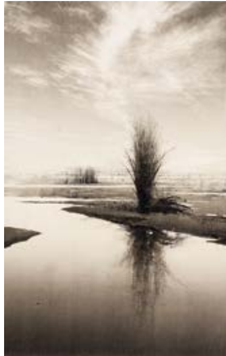
Wendy Orville, Nisqually Poplar . Monotype. 16¾ x 10¾ inches.