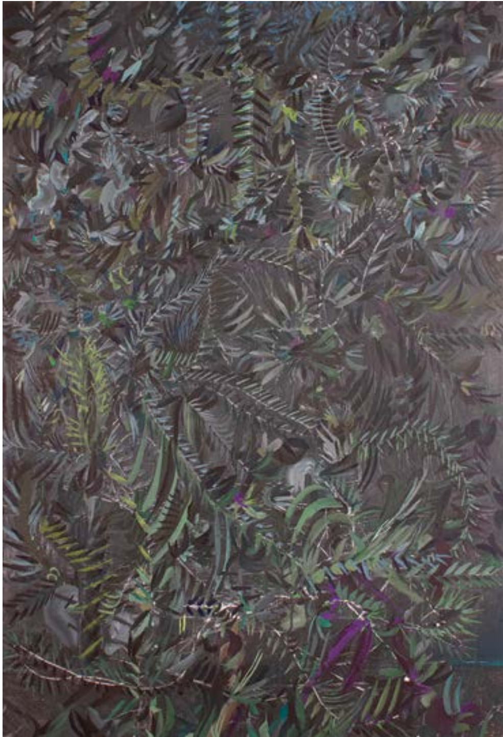
Night Garden , 2022, gouache, acrylic image transfer on silk, wood frame,, 70.5" x 48.5"