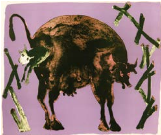
Francisco Toledo, El Corral (The Corral) . Color lithograph on Arches. 18 \frac{3}{8} x 21 \frac{5}{8} inches.

COMING SOON Virginia Hungate-Hawk | What is Visible, What is Imagined