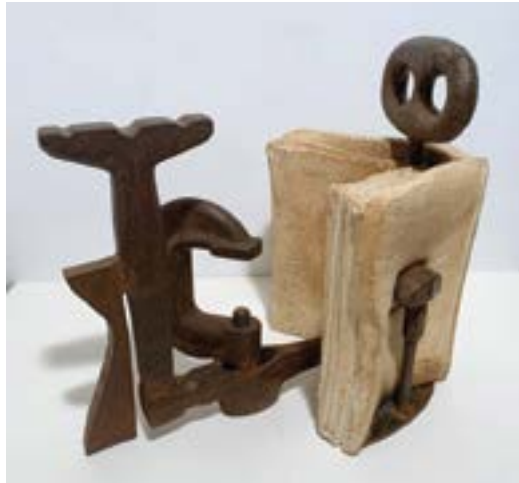
Anthony Caro, UNTITLED , circa 1970s, steel and stoneware, 25.75 x 16 x 12 inches