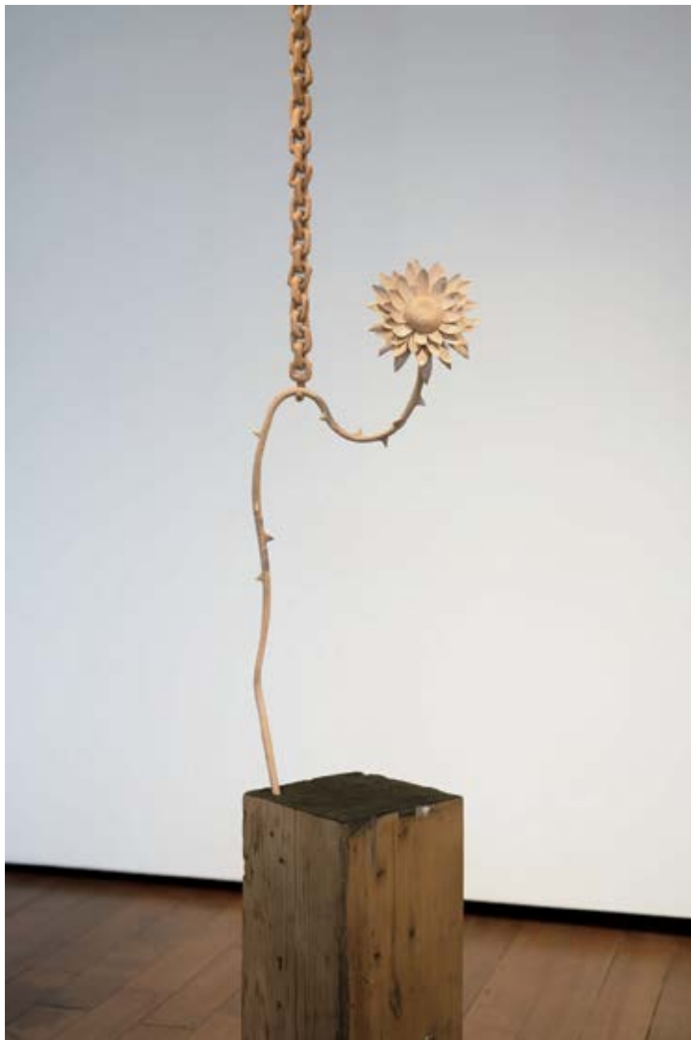
Dan Webb, FEAR OF FLOWERS , 2022, carved and burned wood, 64.5 x 12 x 12 inches approximately, chain dimensions variable