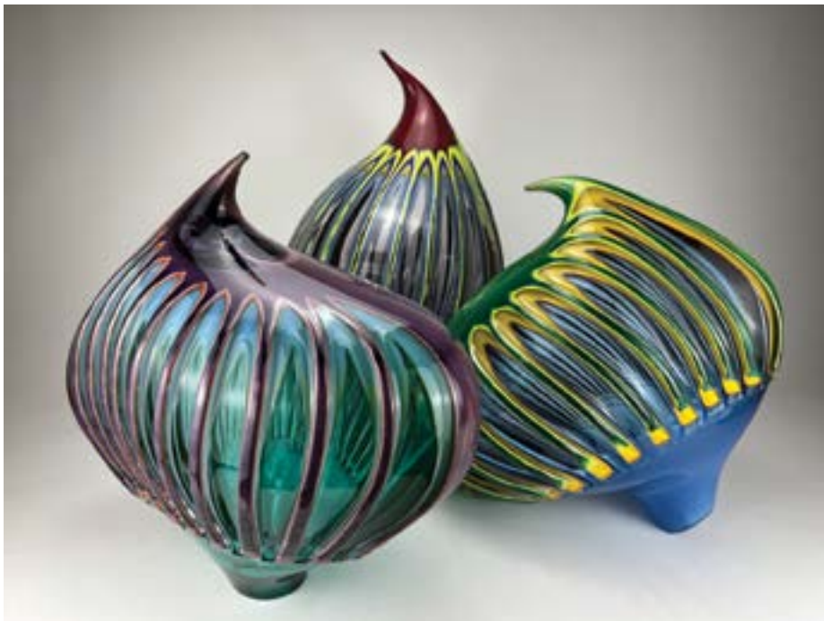
Lovebirds from the Diamond Cut Series , blown & cut glass, 25 x 21 x 16 in. approx.