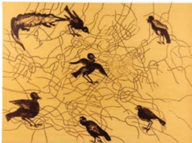
Francisco Toledo, Les Oiseaux / Los Pájaros (The Birds, Yellow Variation) . Color lithograph on Arches. 16 x 22 inches.