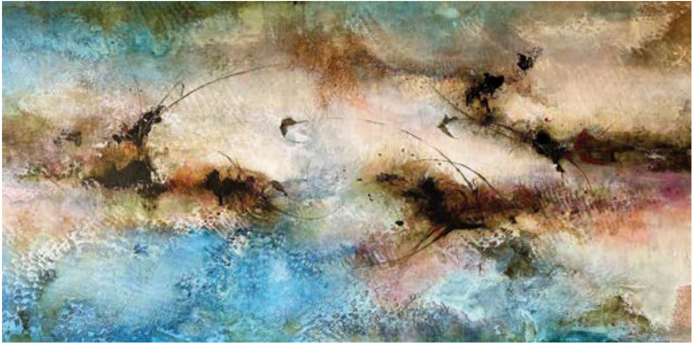
Essence of Life , oil on panel, 34 x 70 in.