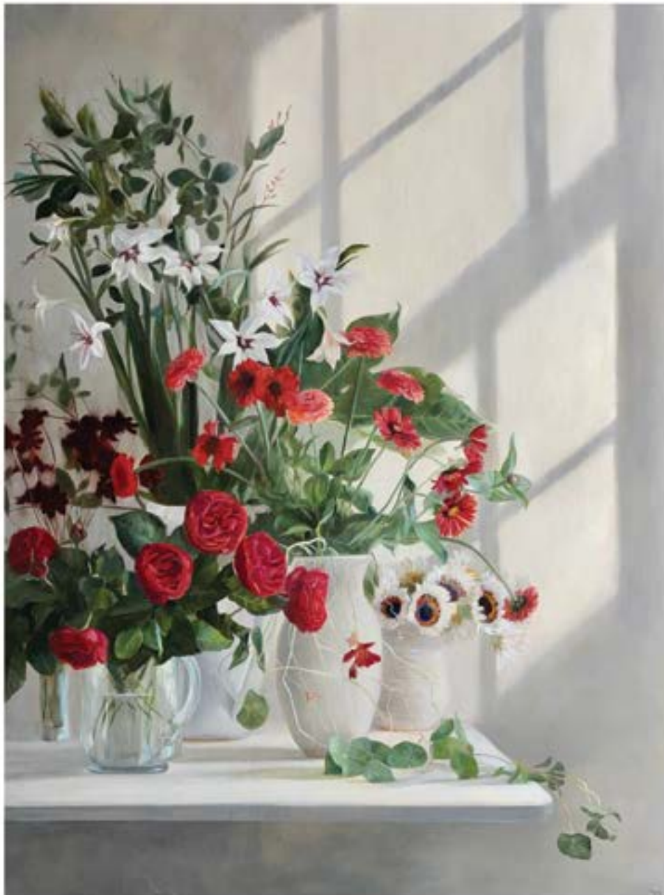
Zinnias and Cape Daisies, oil on panel, 40 x 30 inches, 2022

Artist Reception Friday May 6th, 5 - 7 pm