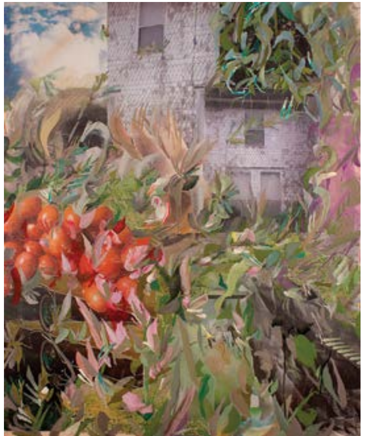
RIGHT: Overgrown House with Tomatoes , 2022 gouache, acrylic image transfer on silk, wood frame, 41" x 33"