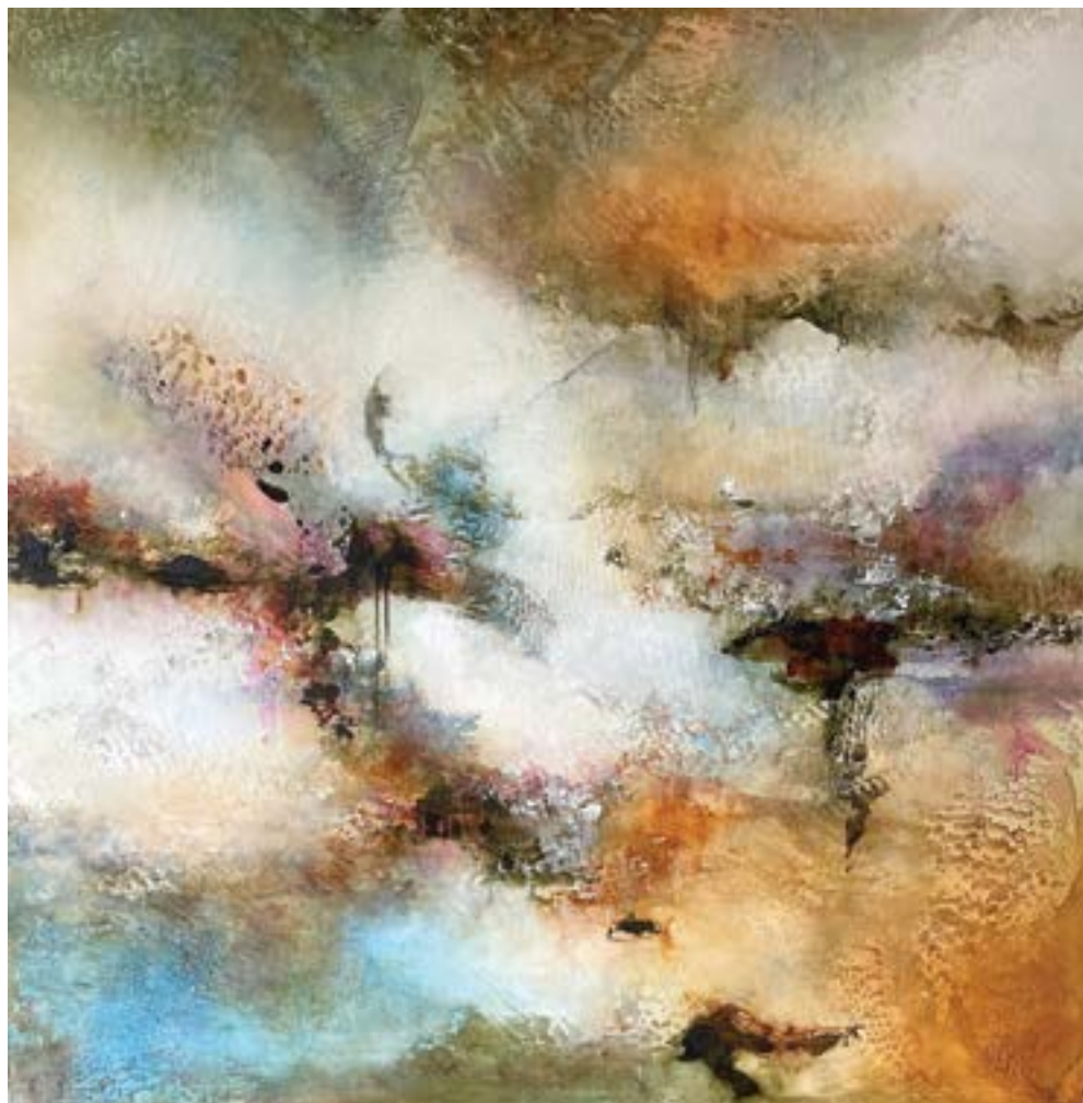
Crossing , oil on panel, 60 x 60 in.

Artist Meet & Greet: Saturday, May 7, 12 - 2 pm