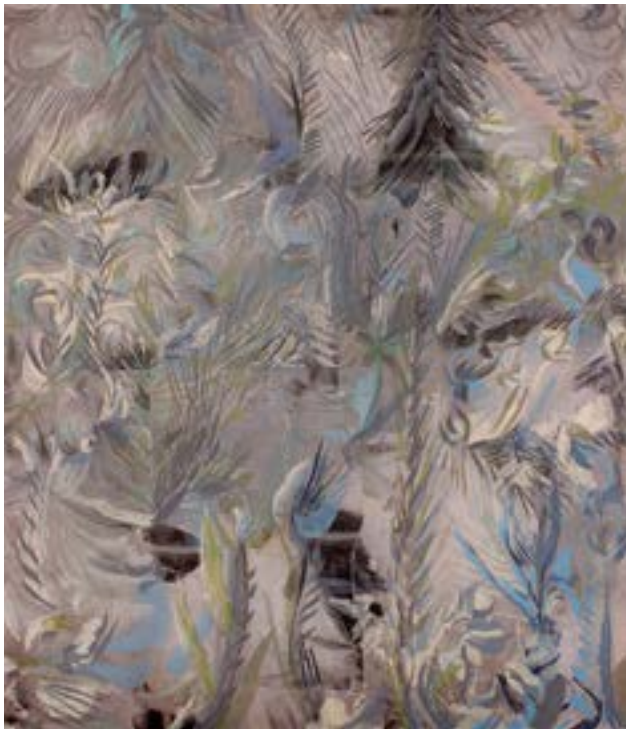
ABOVE: Grey Winter's Thicket , 2022 gouache, acrylic image transfer on silk, wood frame, 35" x 30"