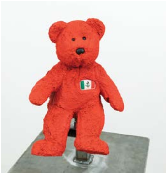
Y TÚ, NI ME MIRAS , 2022 Unique cast bronze, 13 x 9 x 7 inches