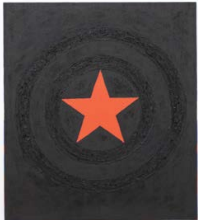
WHEN THEY DO, I'LL BE RIGHT BEHIND YOU , 2022 Acrylic and oil stick on Pendleton blanket, 60 x 53 x 2 inches