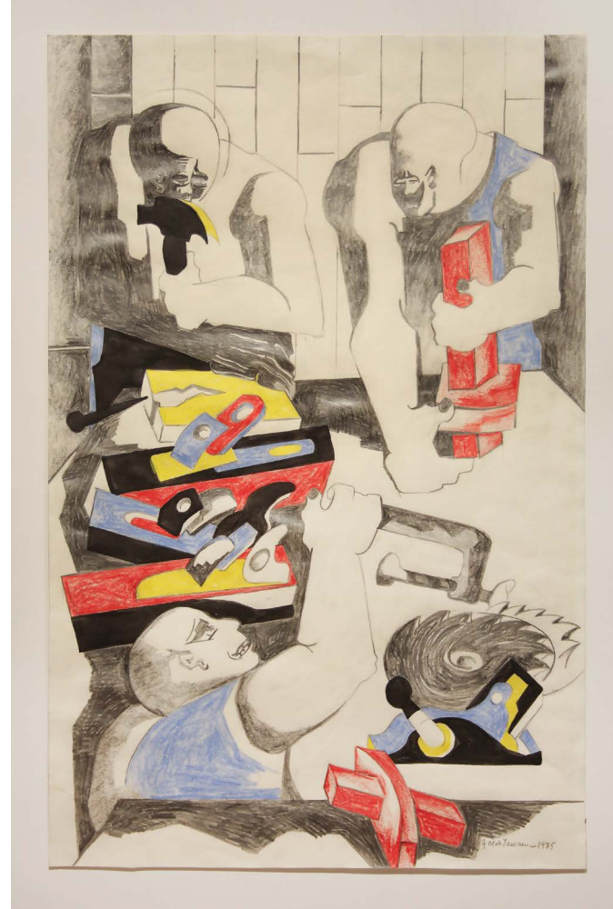
BUILDERS NO. 14, 1985 Colored pencil, ink, and graphite on paper, 20 x 13 inches