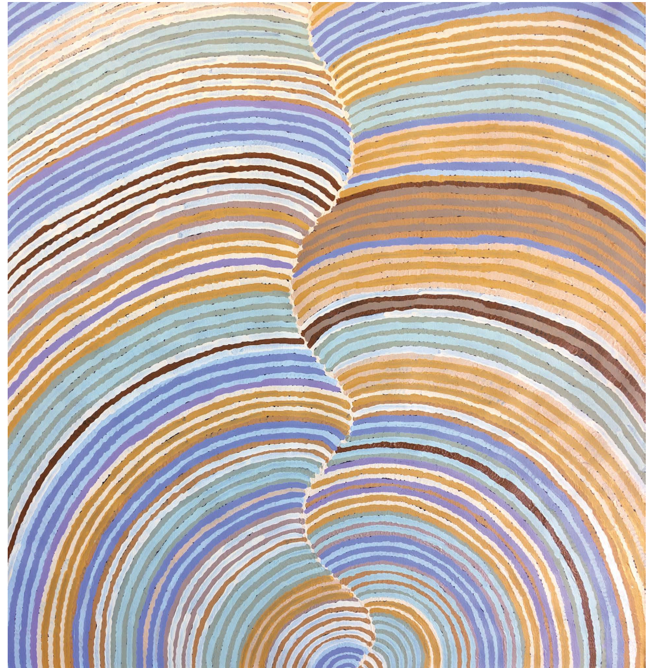
Abie Loy Kemarre, Sandhills 1710 , 2007, acrylic on linen, 47 x 47 inches