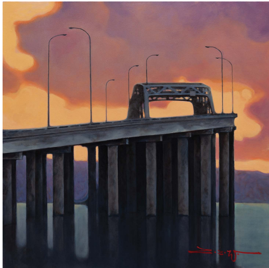
"Passage," oil on canvas, 36 x 36 in.

a celebration with Z.Z. Wei in conjunction with Seattle's First Thursday Art Walk