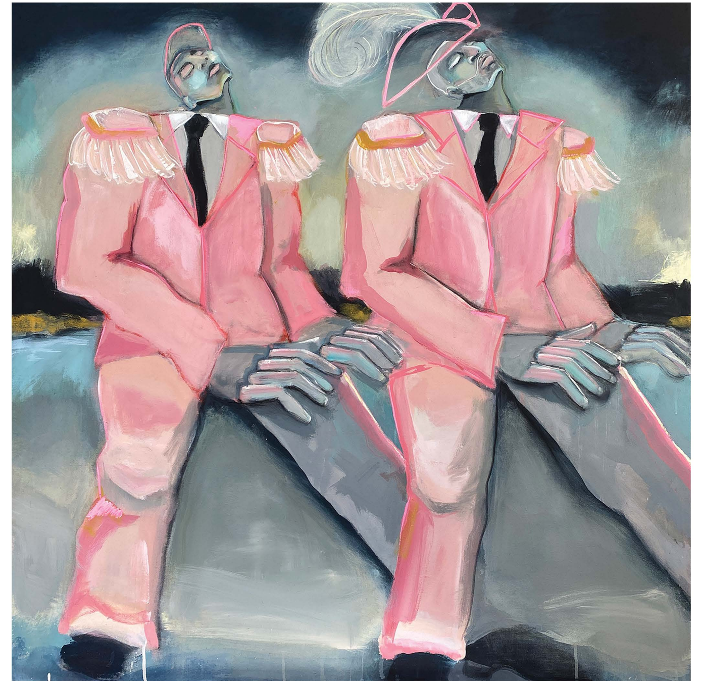
Let There Be Rain Dancers, oil on canvas, 40 x 40, 2023

GREG KUCERA GALLERY 212 THIRD AVENUE S SEATTLE, WA 98104 206.624.0770 www.gregkucera.com staff@gregkucera.com