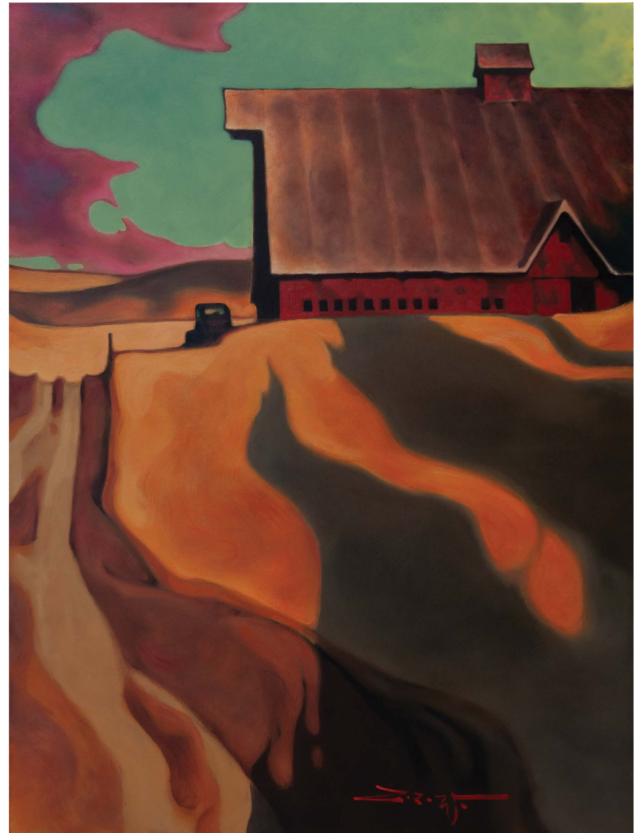
"Reaching," oil on canvas, 48 x 36 in.

www.rovzargallery.com | mail@rovzargallery.com | 206-223-0273 | Hours: Tues - Sat, 11am - 5pm