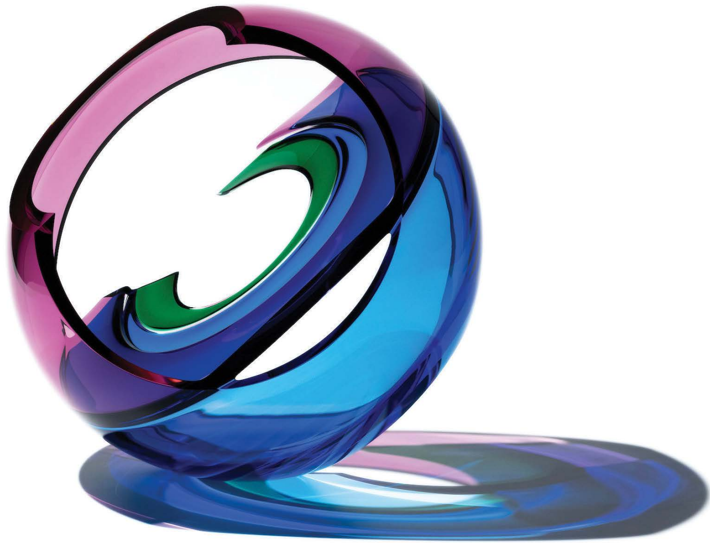
John Kiley, Interior Crescent , 2023, glass, 14.5 x 15 x 8.5 inches