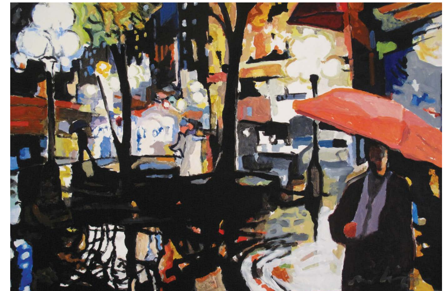
Richard Morhous, Gaslight , 2023, acrylic on board, 24 x 36 in.