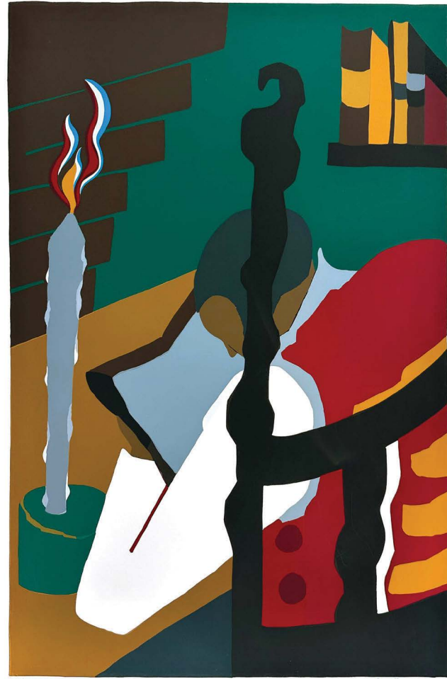
CONTEMPLATION from "The Life of Toussaint L'Ouverture", 1993 Silk screen on Bainbridge two-ply rag paper through hand-cut film stencils 32.25 x 22 inches, edition of 120

Artist Reception- Sat Sept 9th, 5 - 7 pm