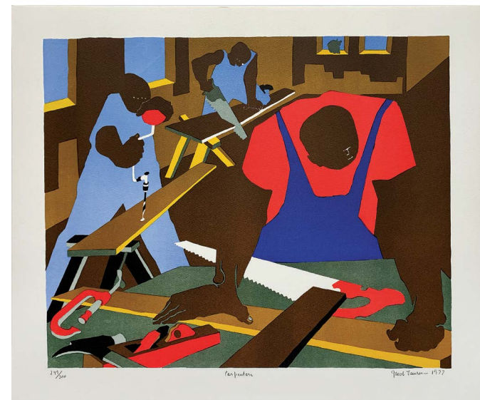
CARPENTERS, 1977 Lithograph, 21.75 x 25.75 inches, edition of 300