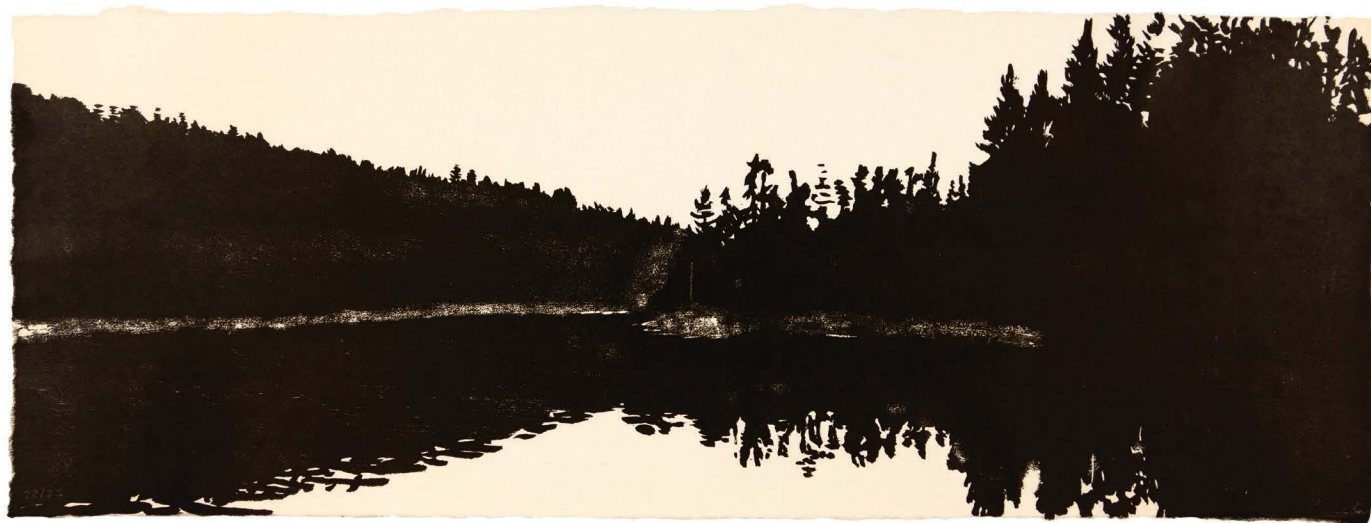
Eva Pietzcker 6 a.m. (Orcas Island) . Moku Hanga Woodcut.