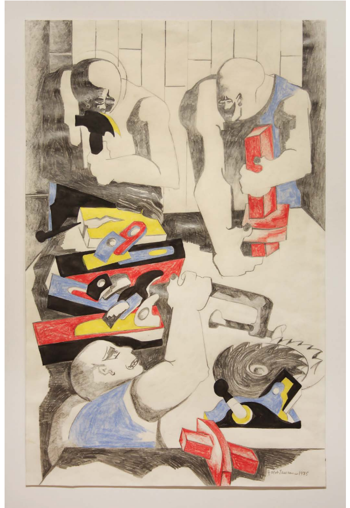
BUILDERS NO. 14, 1985 Colored pencil, ink, and graphite on paper, 20 x 13 inches