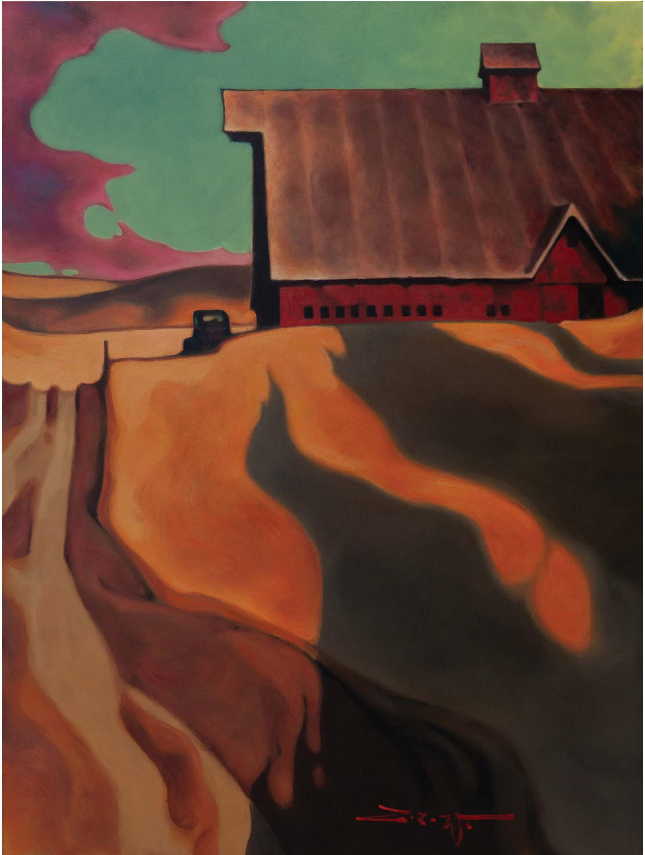
"Reaching," oil on canvas, 48 x 36 in.