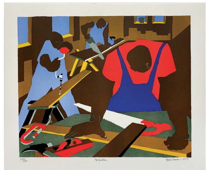
CARPENTERS, 1977 Lithograph, 21.75 x 25.75 inches, edition of 300