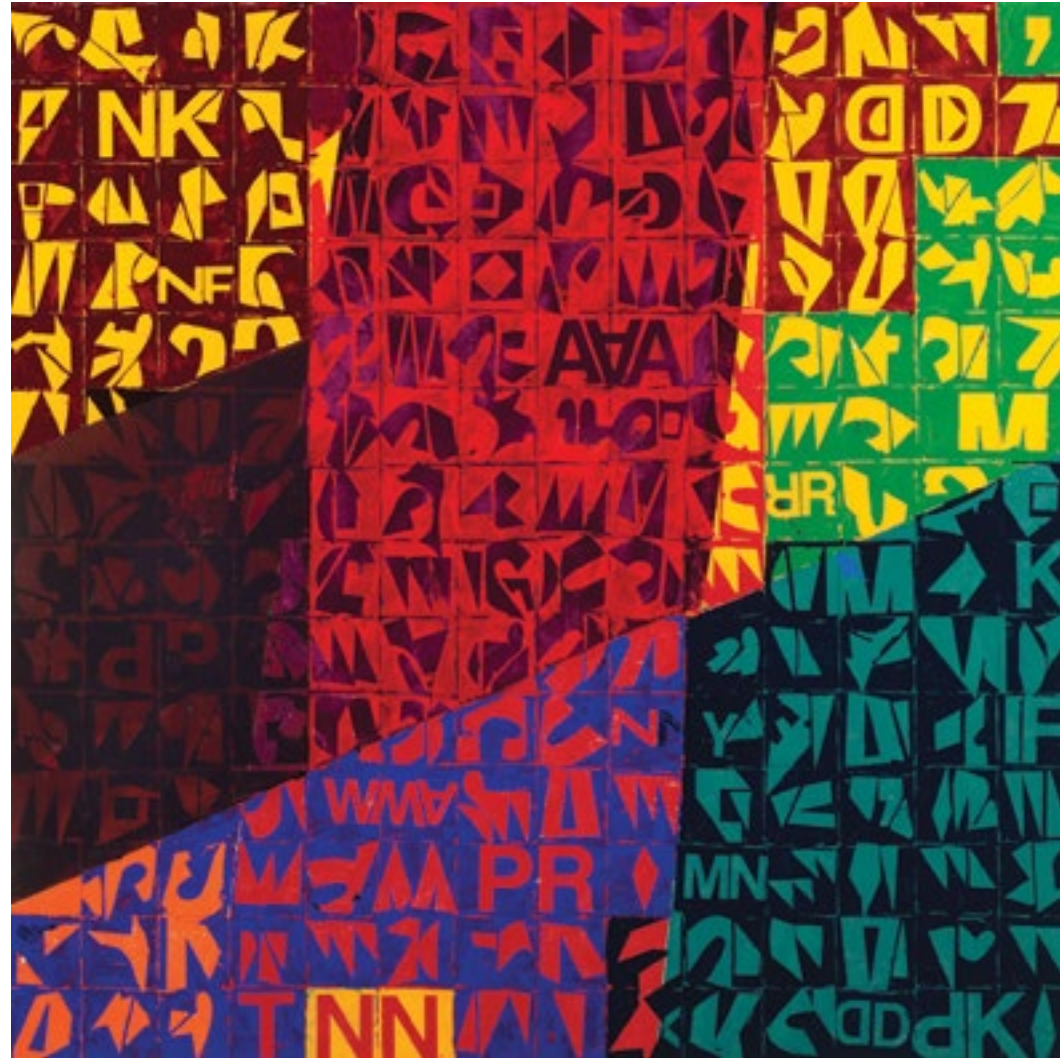
BRATSA BONIFACHO NO SUGAR ADDED DEC 2023 - JAN 2024

Nov 30 - Dec 31 Artist Reception- Sat Dec 2nd, 4 - 6 pm