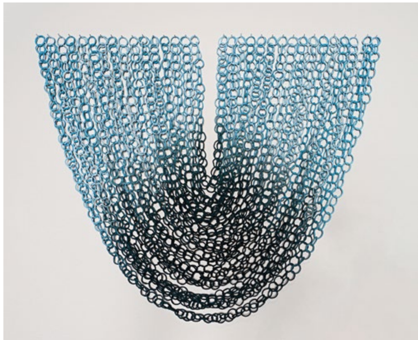
Dharma Strasser McColl, LONG WAVE , 2023, porcelain, mason stains, 27”h x 32”w x 1”d