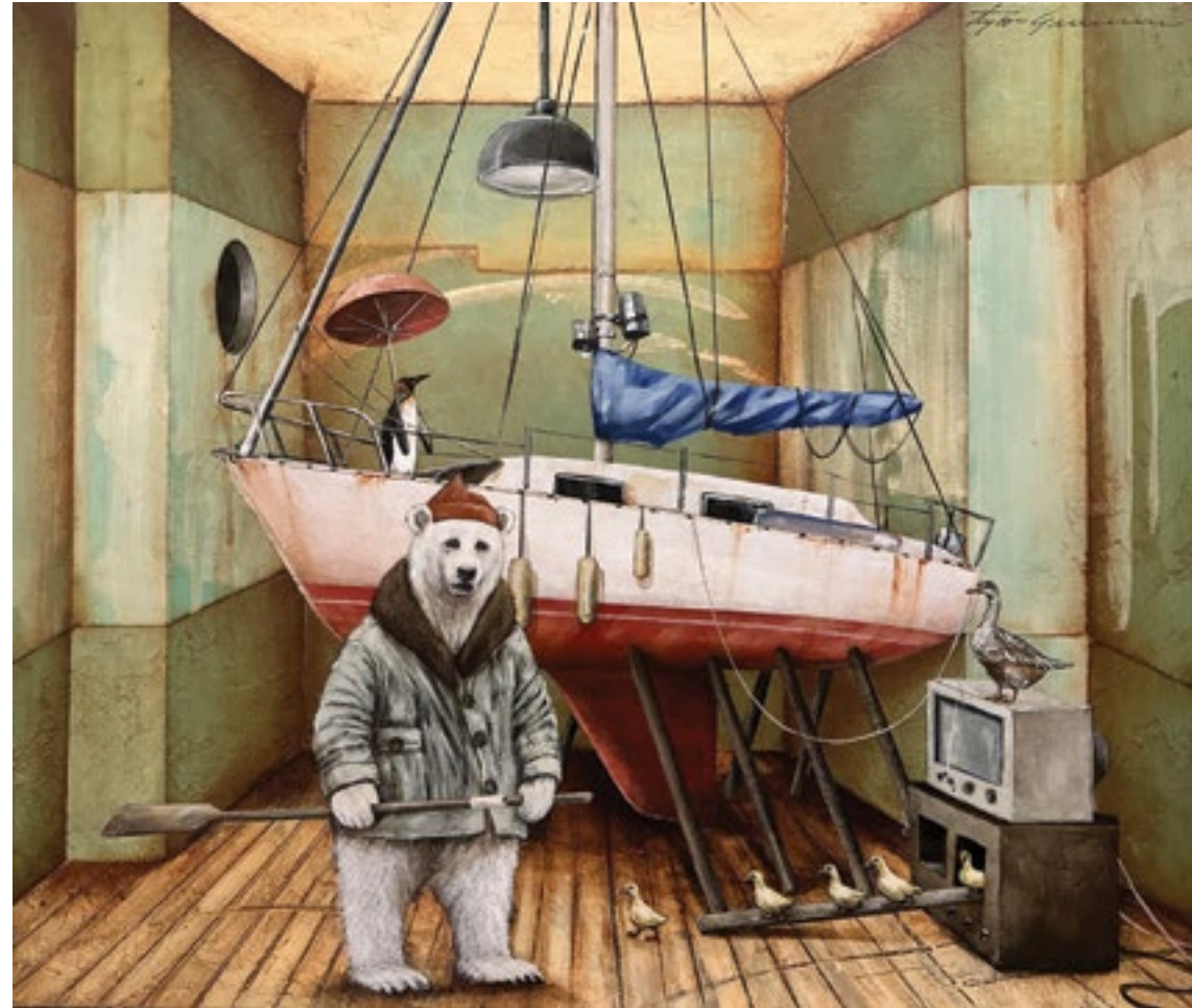
Tyson Grumm, "High and Dry," acrylic on panel, 18 x 21.5 in.