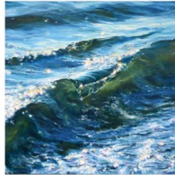
Michele Rushworth- Dynamic , oil, 36 x 36