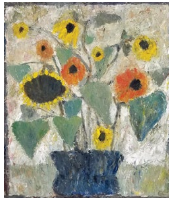
Gregg Laananen, Sunflowers in a Studio Pottery Bowl , oil on panel, 28.375 x 24.5 in.