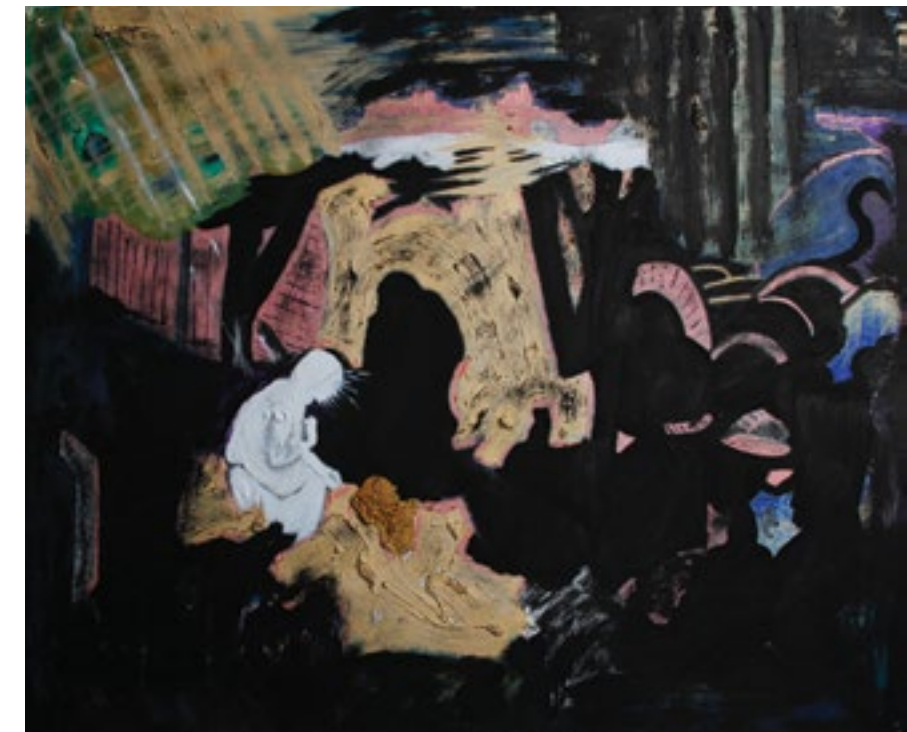
STILL UNTITLED #21, 2023, oil on silver gelatin, 20 x 24 inches