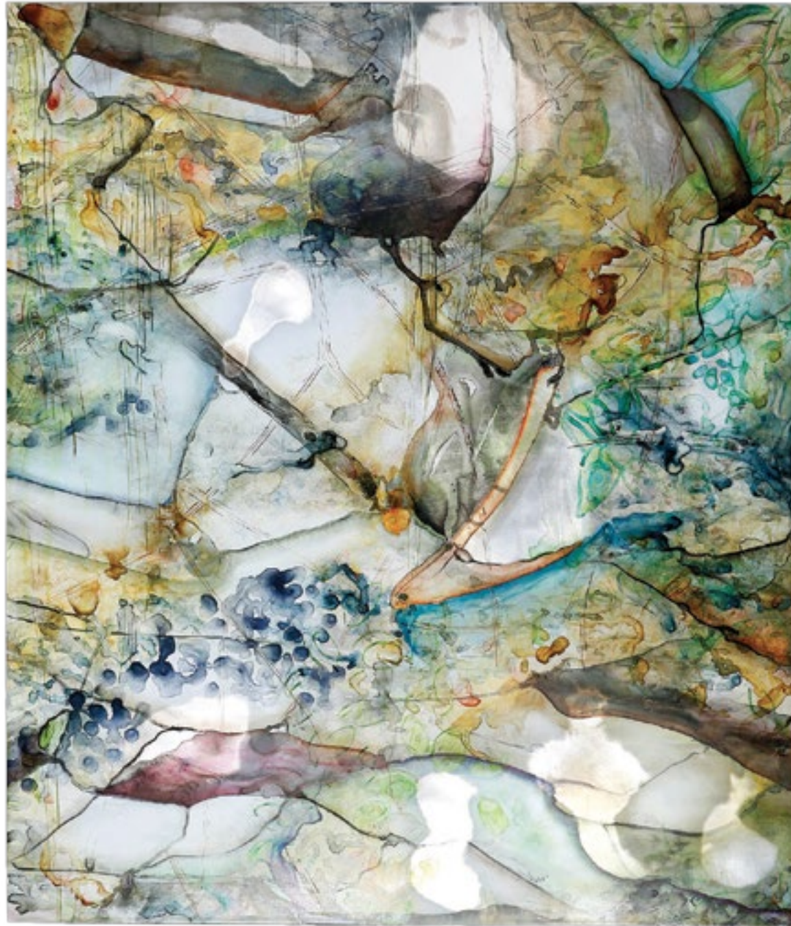
GARDEN VARIETY, 2023, ink on aluminum, 37.5 x 31.25 inches

"First Thursday" Art Walk: December 7, 6–8pm