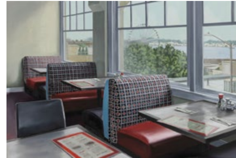
Gabe Fernandez, "Pike Place Chinese #3," oil on panel, 20 x 30 in.