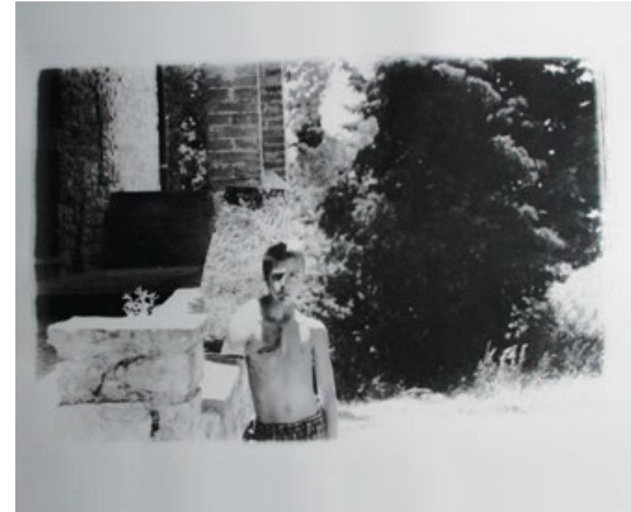
UNTITLED #101, 2004, silver gelatin print, 20 x 24 inches, edition of 8

"First Thursday" Art Walk: December 7, 6–8pm