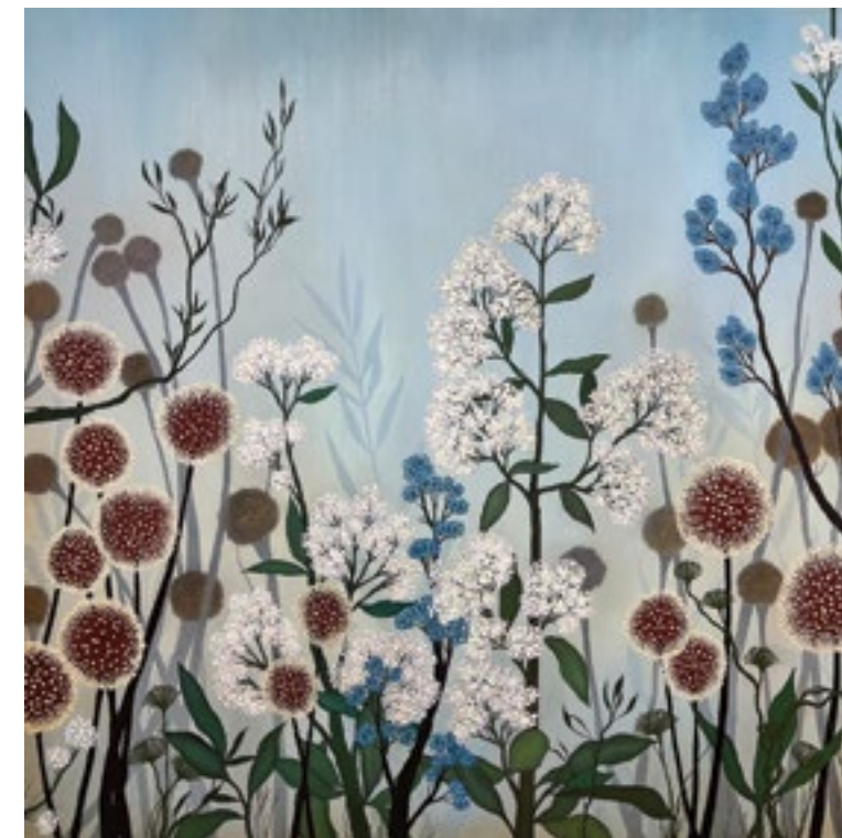
Ivy Jacobsen, "Let It Carry You," oil, acrylic & collage on panel, 48 x 48 in.