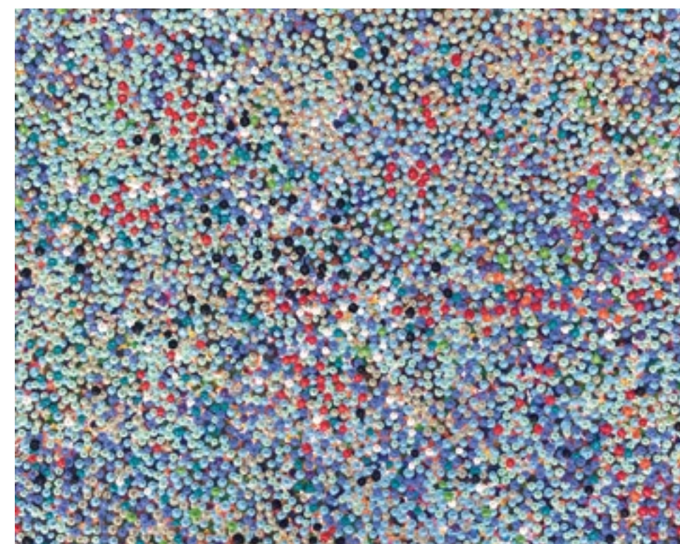
Marcio Díaz, Detail of Born in Color , acrylic on canvas, 48x60 in