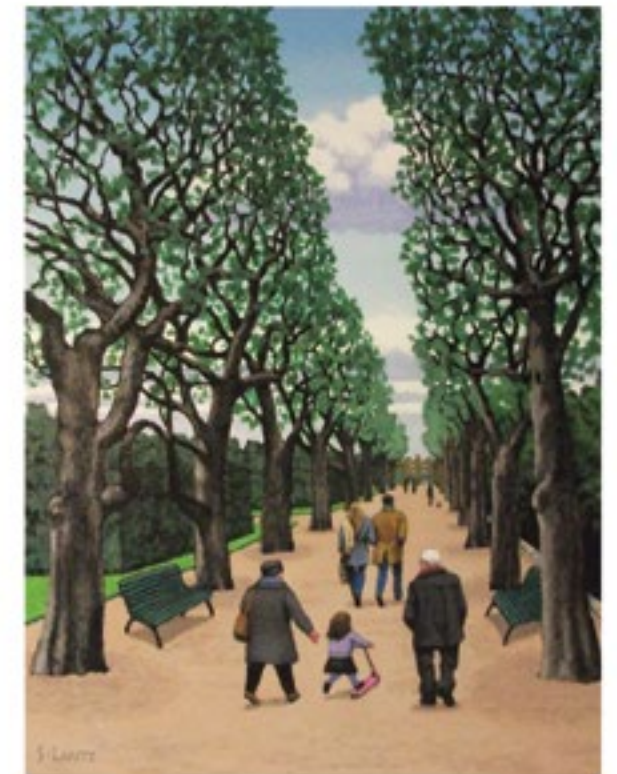
Scott Lantz- Promenade , acrylic, 24 x 18