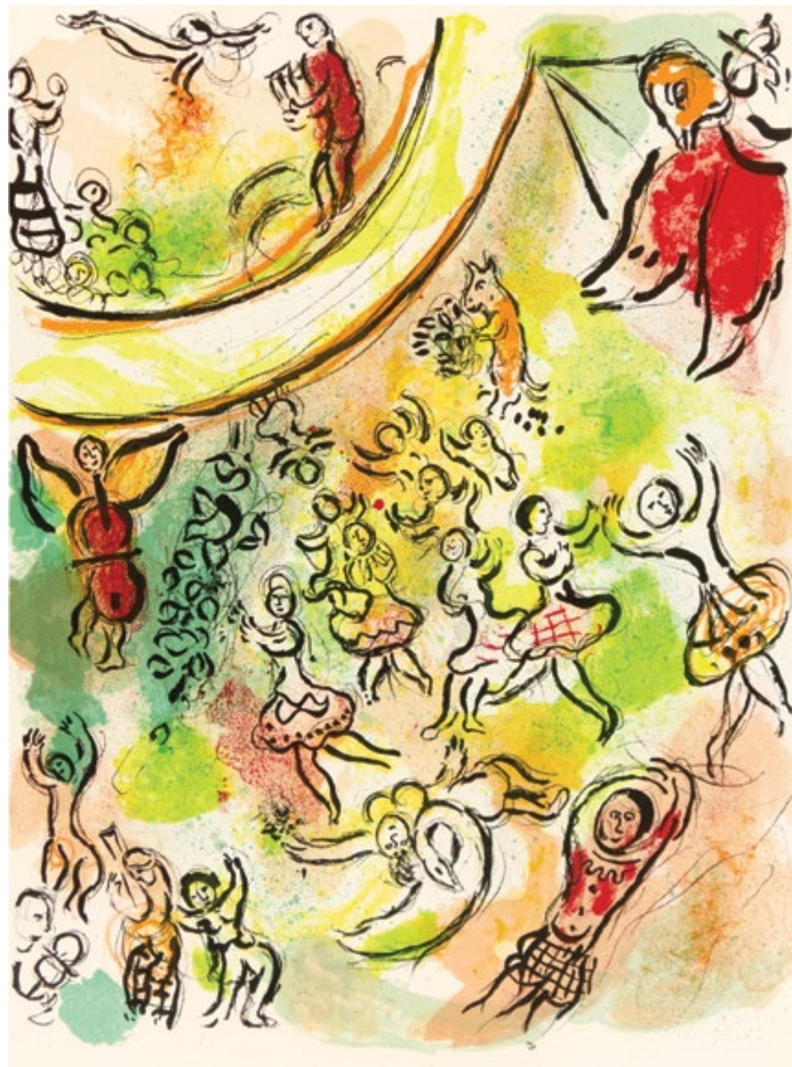
Marc Chagall, Frontispiece for Le Plafond de l'Opéra de Paris . Color lithograph.