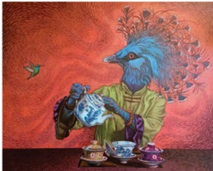
Tea Taken in Tranquility acrylic, 24 x 30