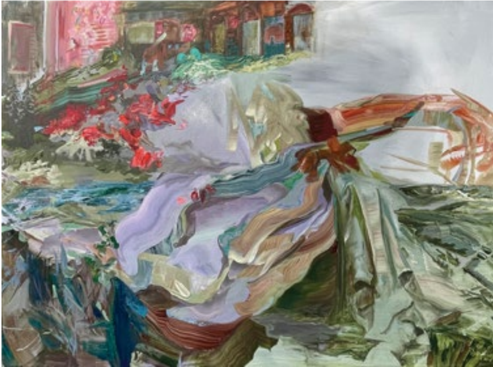
EMBRACING EVENING, 2024, acrylic and oil on canvas, 36 x 48 inches