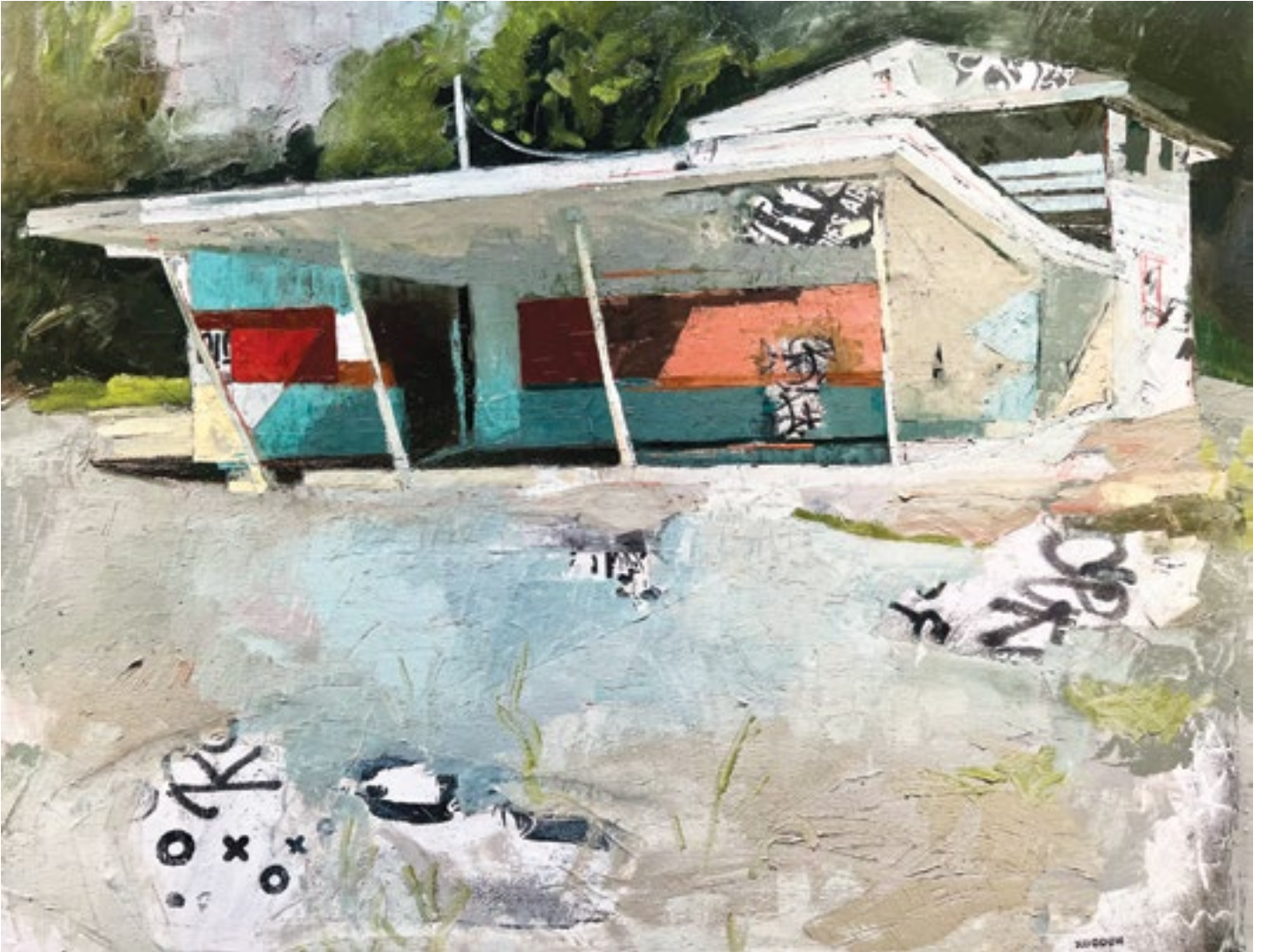
Daphne Minkoff, Façade of Durability: View 2 , collage, oil on canvas, 32 x 40 in.