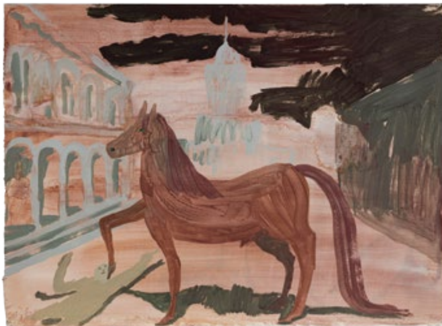
THE STORM, 2023, flashe on paper, 19.5 x 24.75 inches