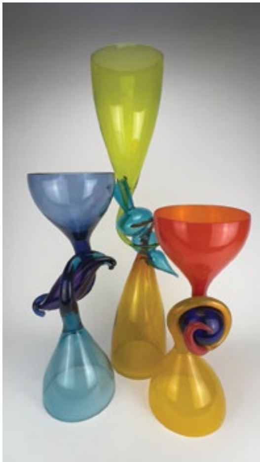
Richard Royal, "Relationship Series," blown glass L-R: 23 x 9 x 8 in. | 34 x 7 x 7 in. | 20 x 8 x 8 in.