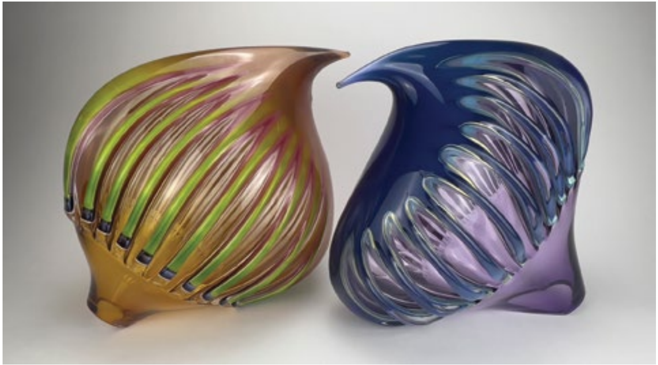
Richard Royal, "Lovebirds, Diamond Cut Series," blown glass, L: 17 x 17 x 13 in. | R: 18 x 18 x 11 in.