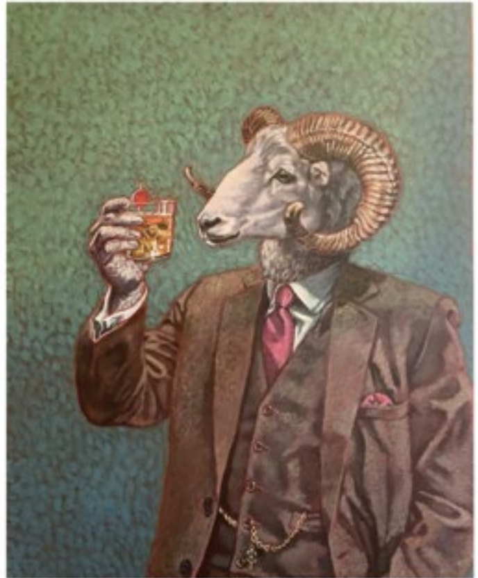
Across a Crowded Room Part II , acrylic, 30 x 24