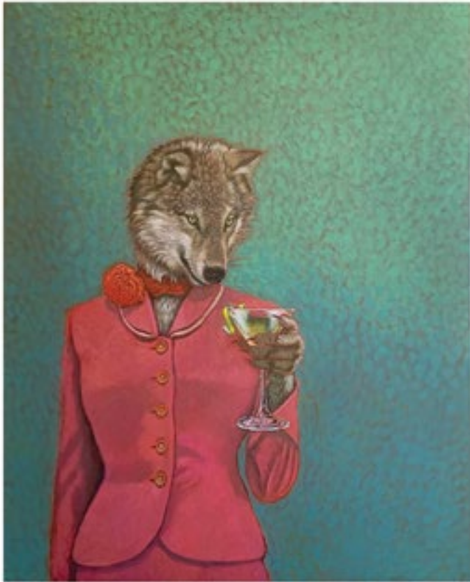
Across a Crowded Room Part I , acrylic, 30 x 24