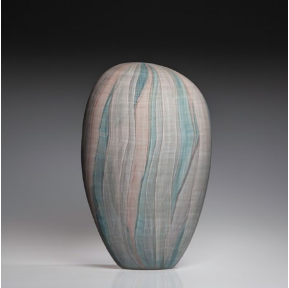
Clare Belfrage, Quiet Shifting Blue and Coral , 2018, 20. x 12 x 7 in, blown glass with cane drawing, hand-sanded and polished