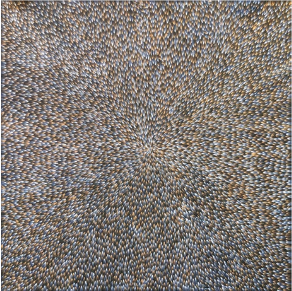
Abie Loy Kemarre, Bush Medicine Leaves 6743 , 2006, acrylic on linen, 47 x 47 inches