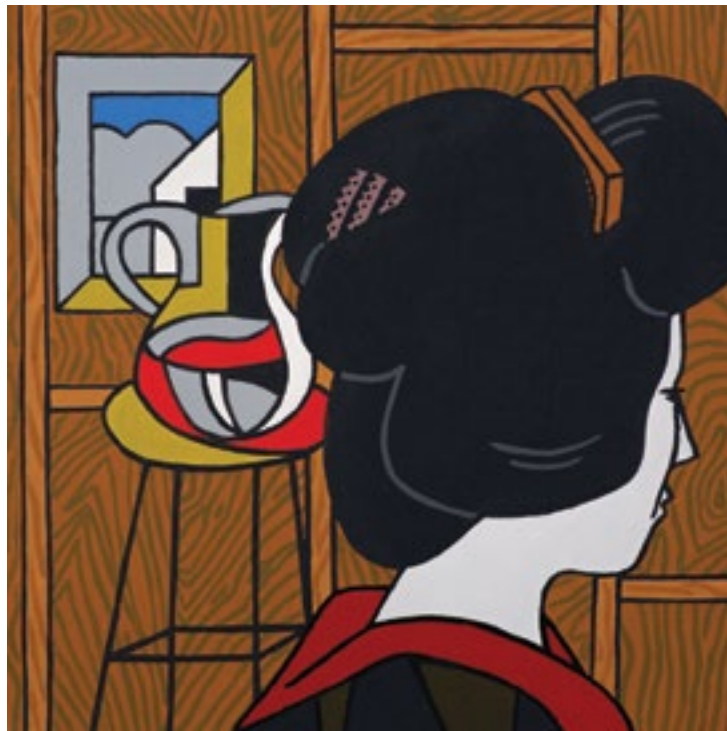
MORE LITTLE WHITE LIES #18, 2022, acrylic on canvas, 12 x 12 inches